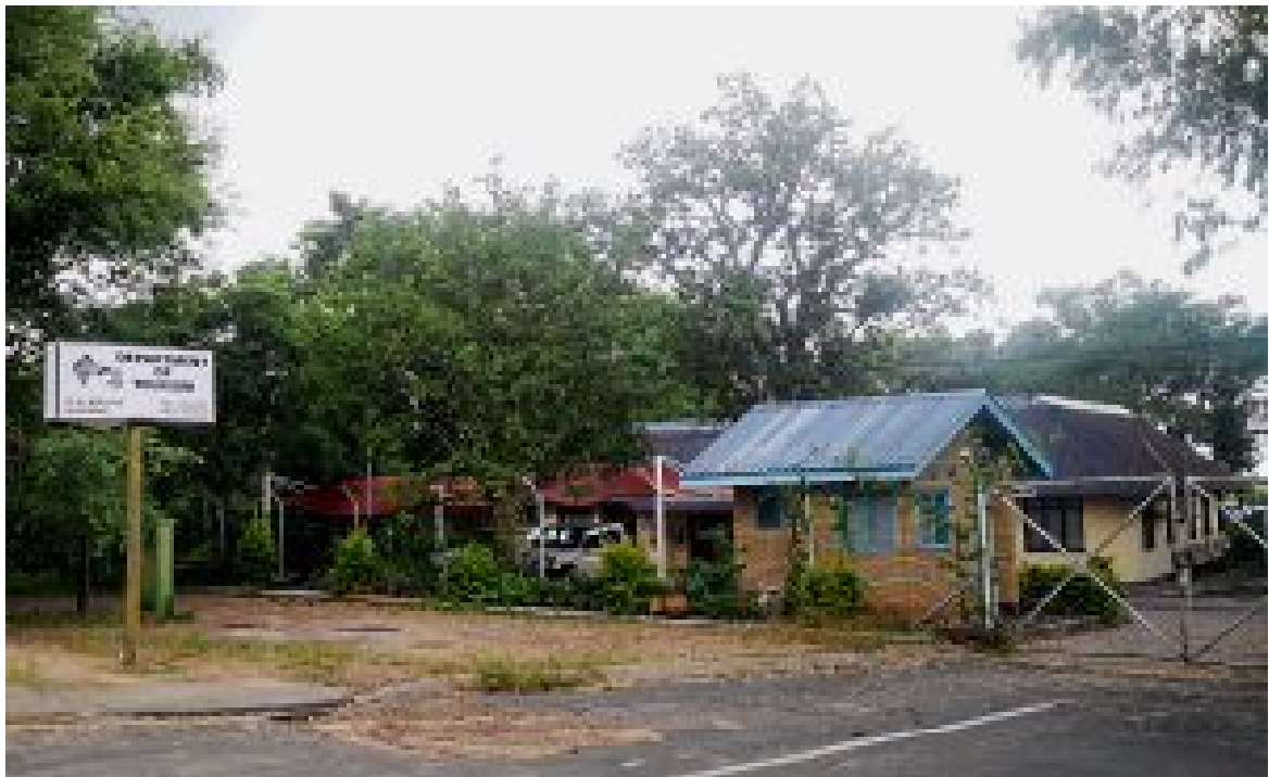
Department of Tourism – Kasane, Botswana in the Chobe region