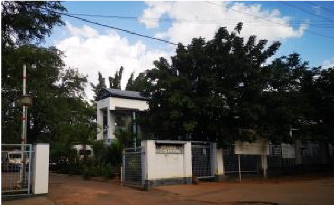
Kasane Hospital – Kasane, Botswana in the Chobe region