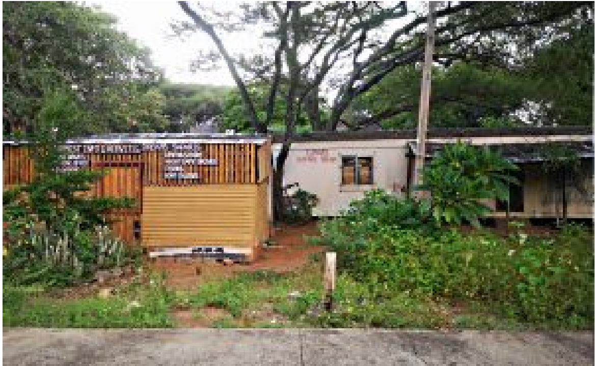
Tourist, safari center – Kasane, Botswana in the Chobe region