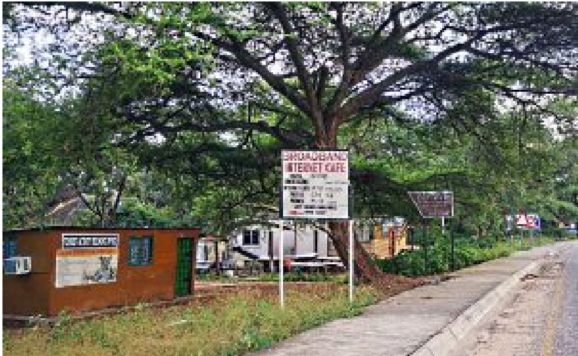
Internet cafe – Kasane, Botswana in the Chobe region

Here's a glimpse of life in the town of Kasane: