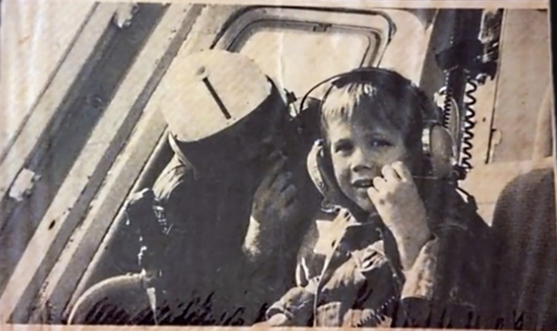
A pilot from the OPP detachment teaches his young co-pilot the secrets to flying a helicopter. The OPP helicopter was a big attraction with kids at this year's Carp Fair, Sept. 26-28.