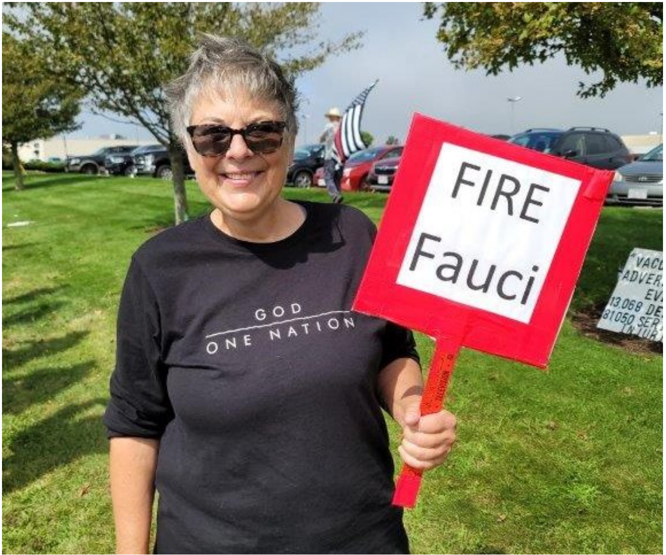
Protest against medical tyranny, Sept. 18, 2021