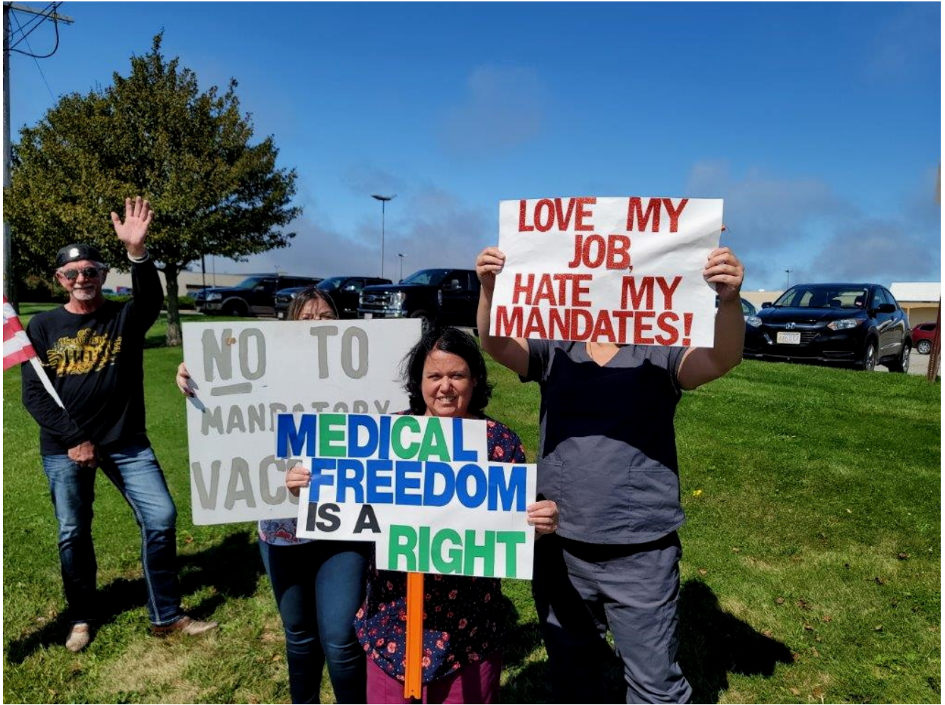
Protest against medical tyranny, Sept. 18, 2021