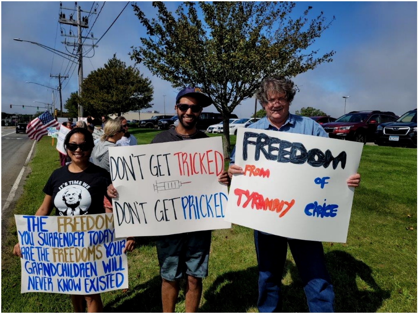
Protest against medical tyranny, Sept. 18, 2021