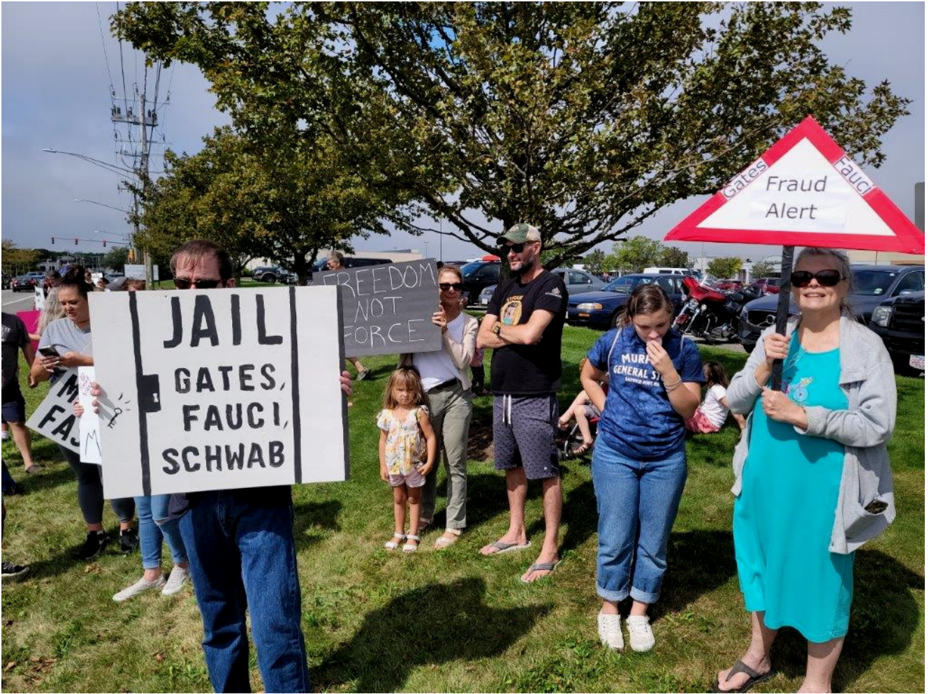
Protest against medical tyranny, Sept. 18, 2021