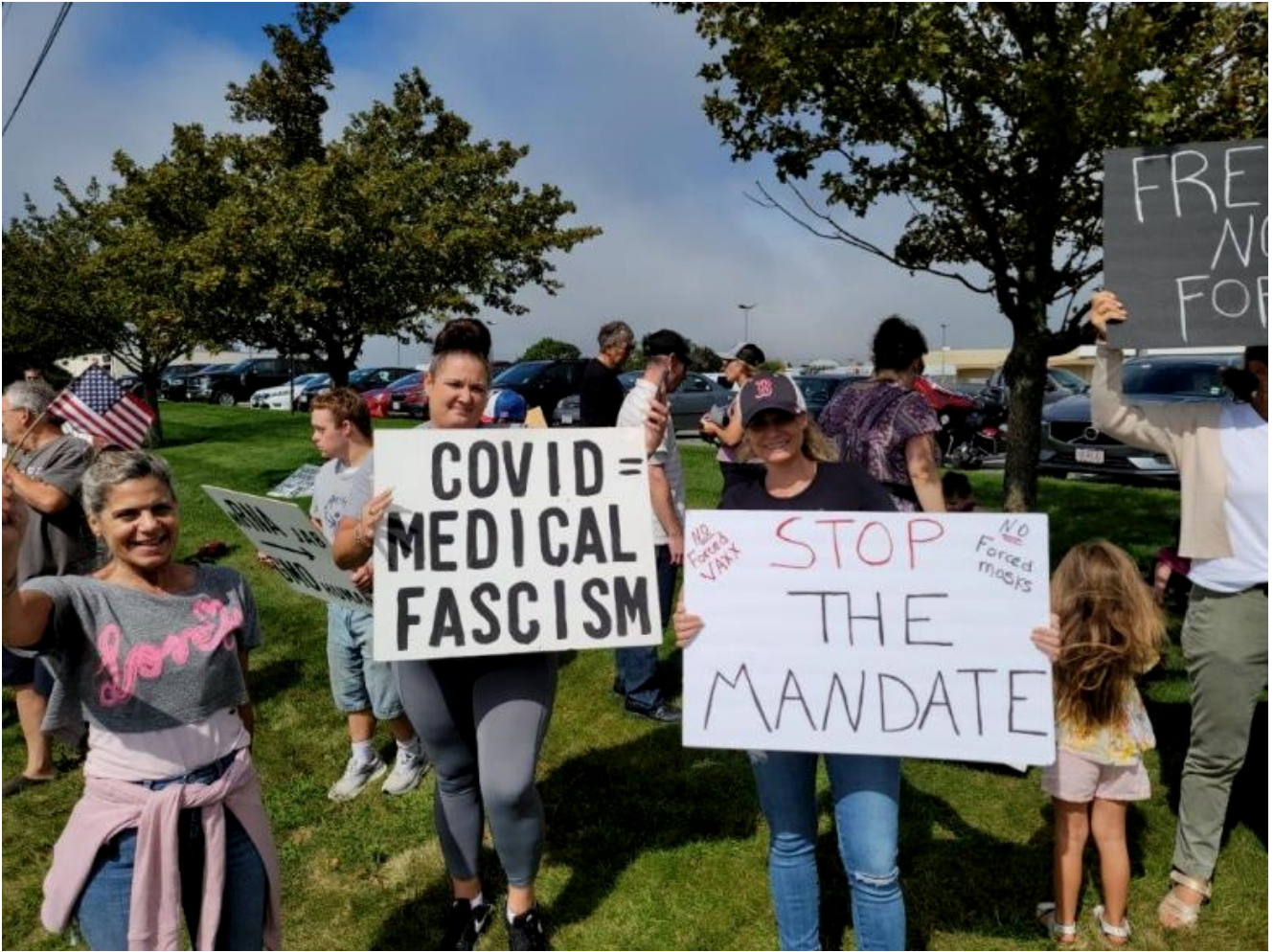
Protest against medical tyranny, Sept. 18, 2021