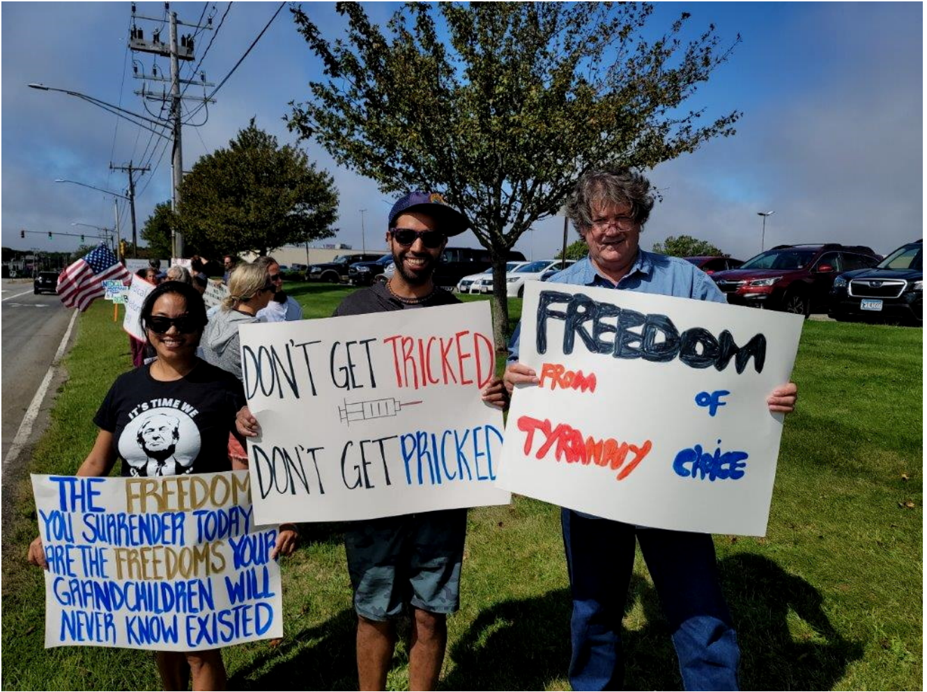
Protest against medical tyranny, Sept. 18, 2021