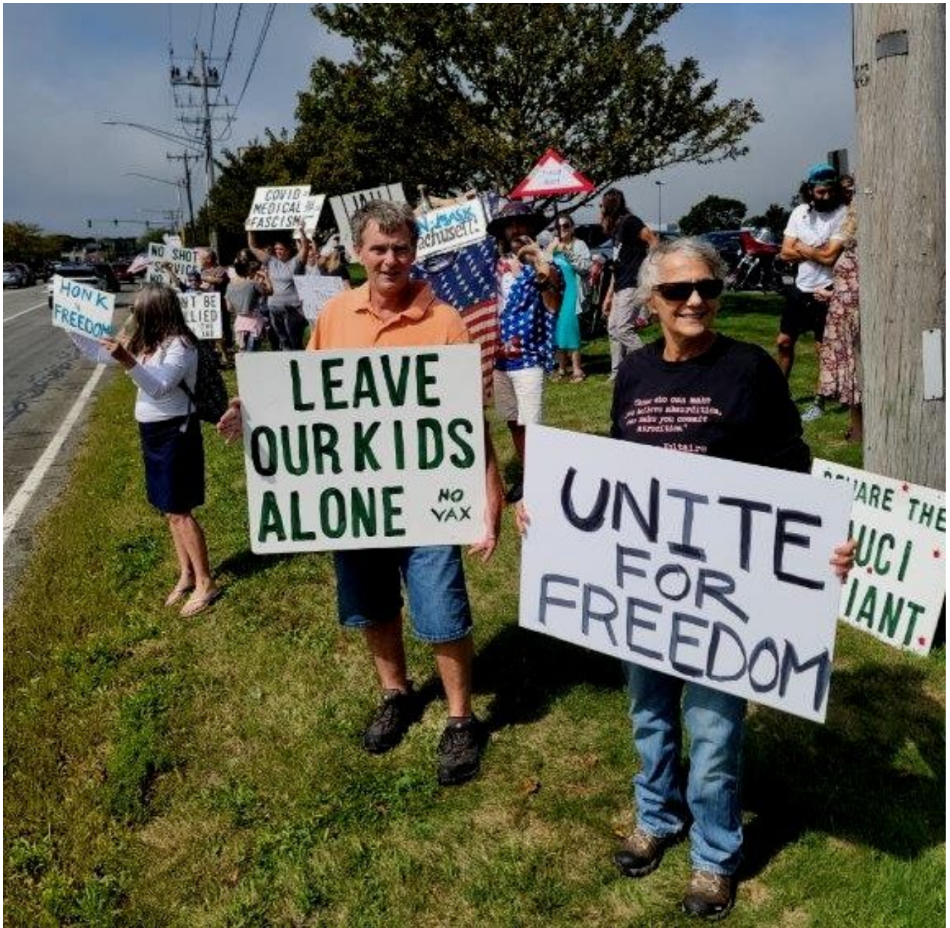
Protest against medical tyranny, Sept. 18, 2021