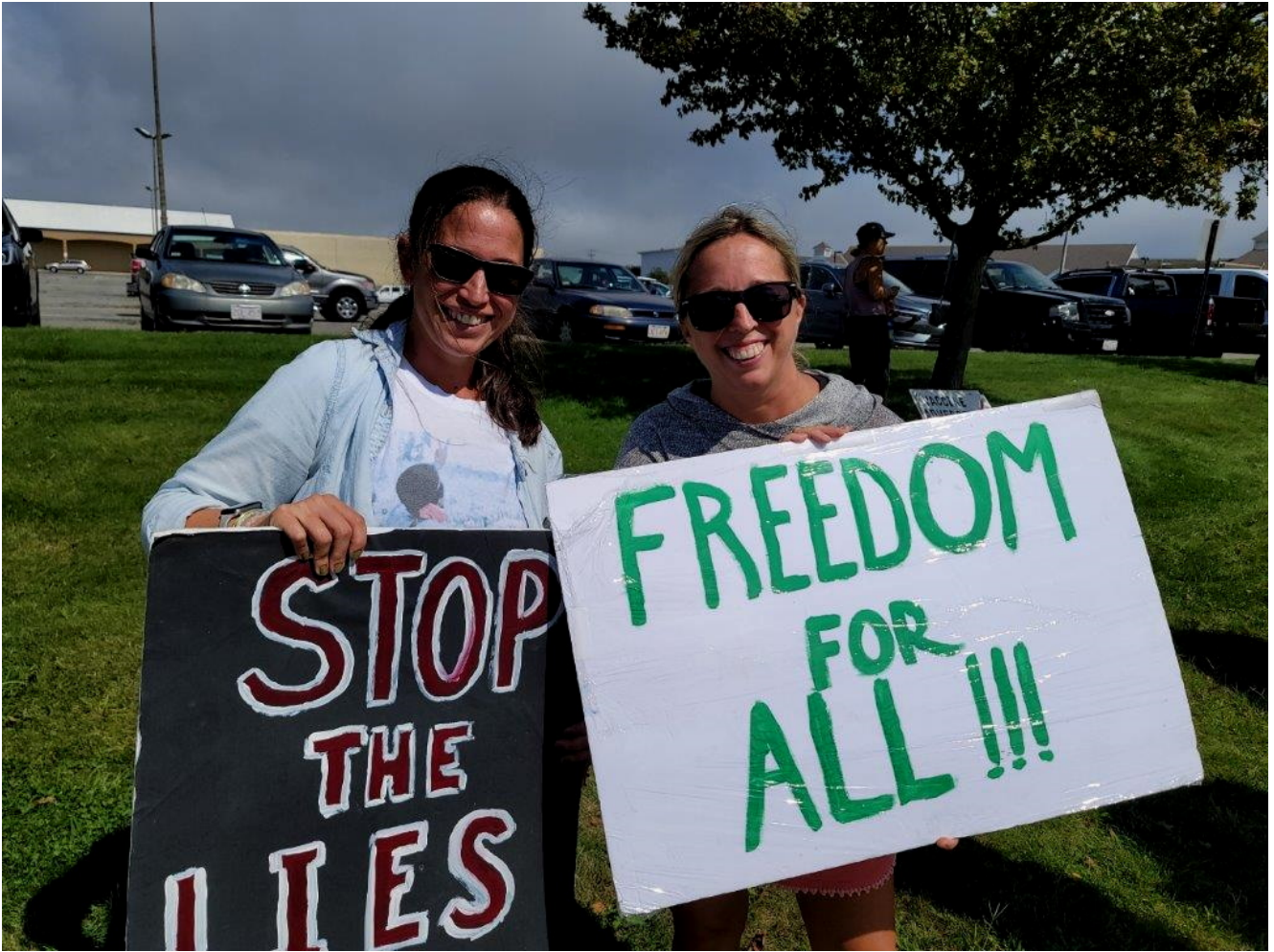
Protest against medical tyranny, Sept. 18, 2021