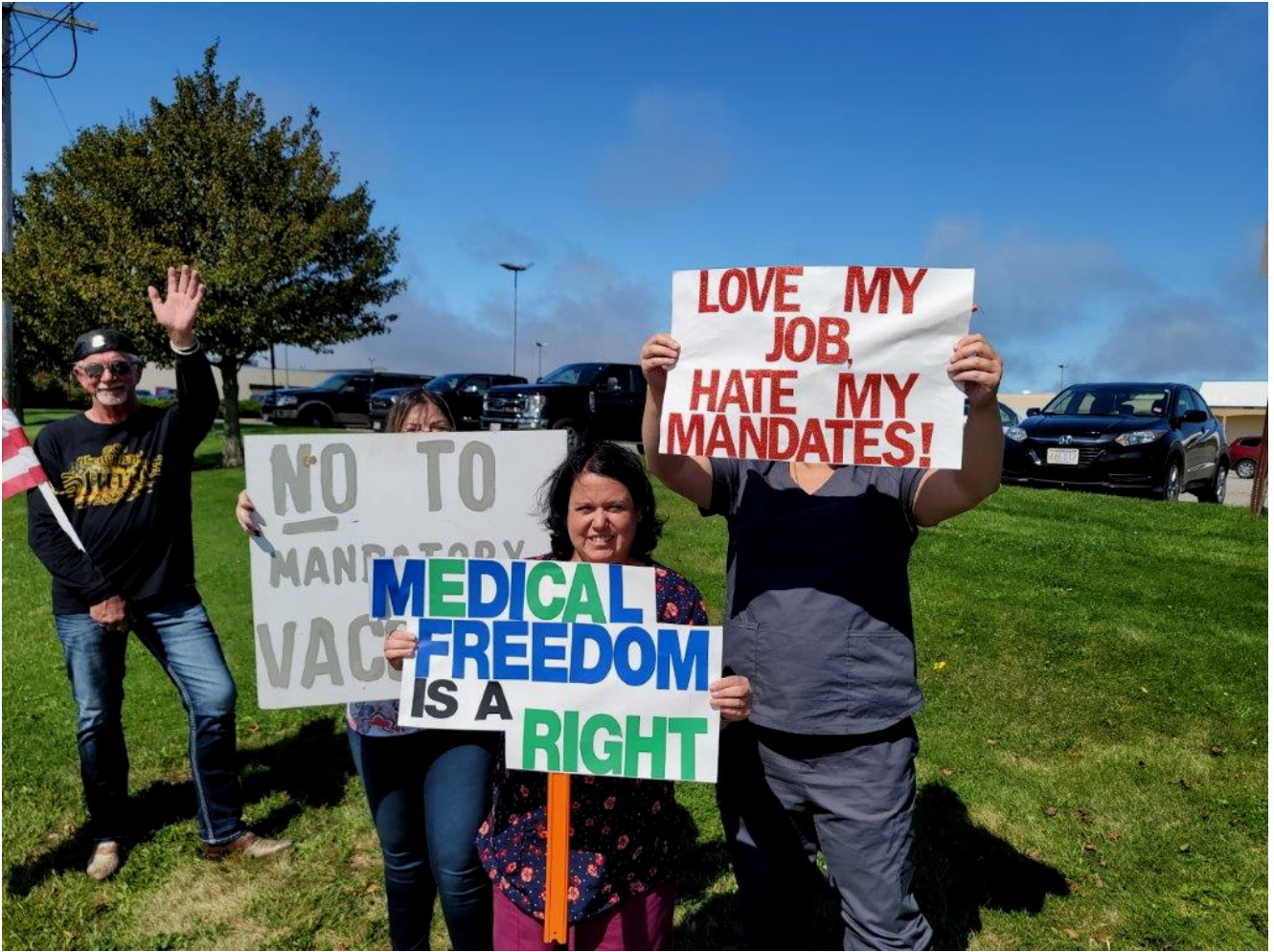
Protest against medical tyranny, Sept. 18, 2021