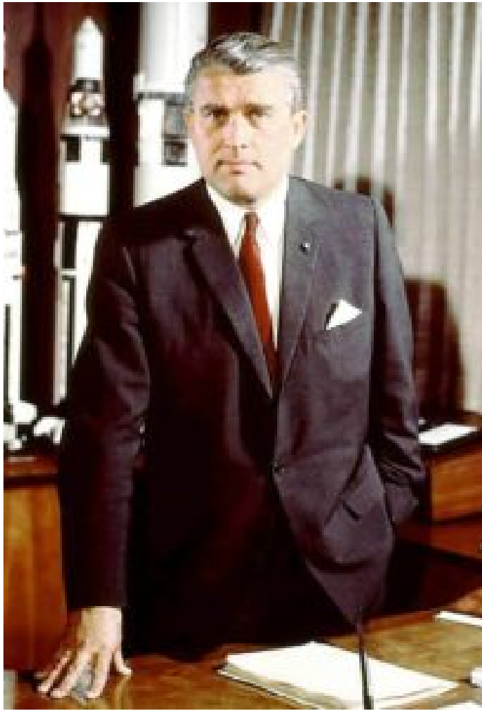
Wernher von Braun

Von Braun's early work in America involved the further development of missiles based on the German V-2 rocket which the Nazis had used to terrorize Britain during the war. This work was conducted at the U.S. Army's Fort Bliss in Texas, at the White Sands Proving Ground in New Mexico, and at the Redstone Arsenal in Alabama. Von Braun and many of his fellow Operation Paperclip Nazi scientists later worked for NASA.