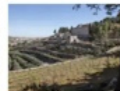
Geologists solve archaeological mystery about early farmers in Israel

Claim 2: Israel is the only place in the Middle East where women have rights