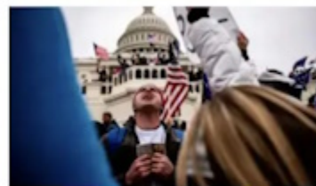
This is Trump's legacy