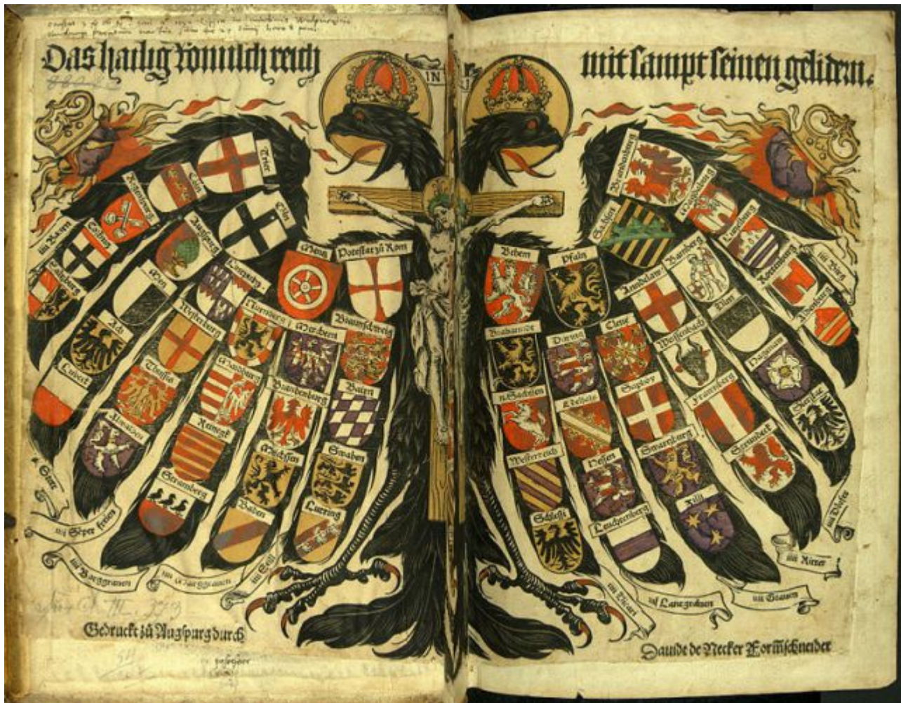
eagle of the Holy Roman Empire