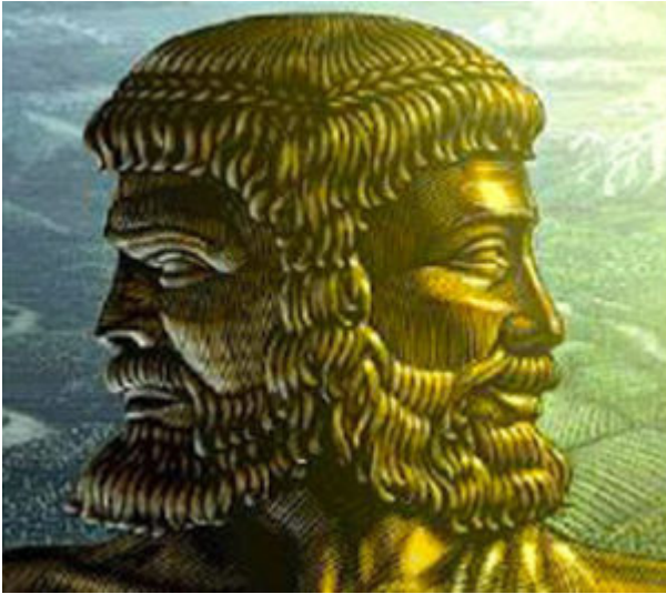
Janus Bifrons ~ Who was the two-faced Greco-Roman god?

The irony is that people not only know their rulers and society overall are two-faced, they expect it.