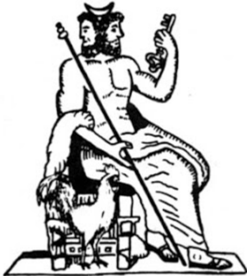
Janus with key and cock

Note Janus was depicted with a key. It turns out there's a lot to this. Remember he's the god of doors.