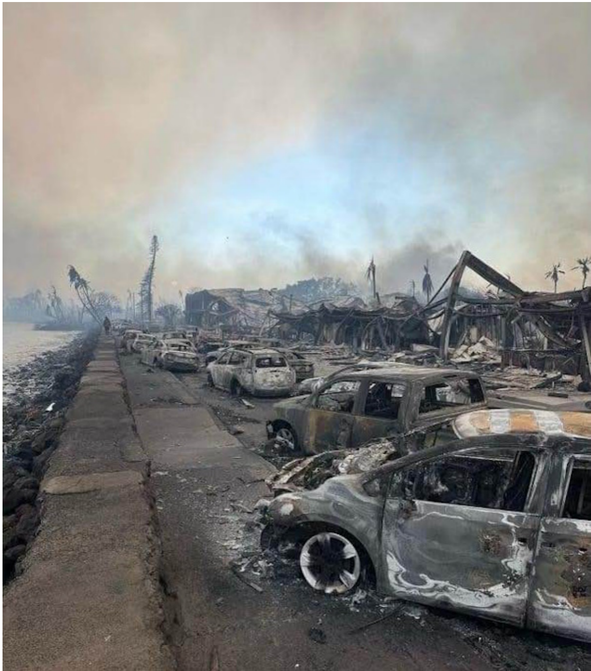
Burned out cars and the remains of buildings are seen in Lahaina town in this image captured Wednesday by U.S. Civil Air Patrol.