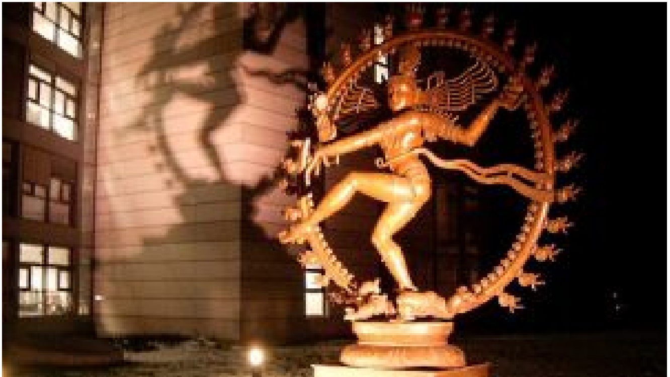
Statue of Lord Shiva at CERN near the building A40. The statue is a gift from India's Department of Atomic Energy, celebrating CERN's long association with India which started in the 1960's and continues strongly today. Unveiled at June 18 2004.