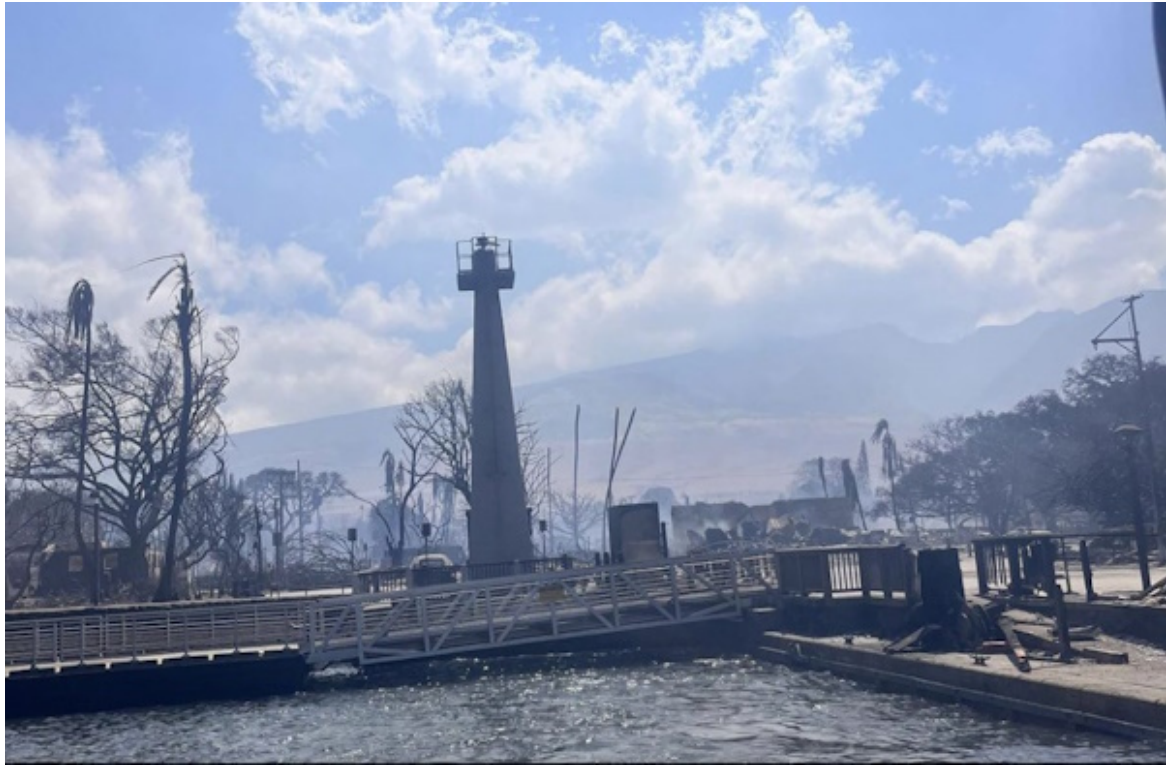
Lahaina Lighthouse surrounded by ruins after August 2023 wildfire