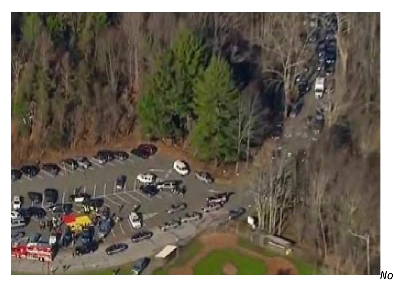
bodies (dear or injured) were ever placed on the triage tarps and Dickinson Drive was so crowded no emergency vehicles could have even gained access to the school.

evidence handling, failure to follow Connecticut laws involving mass shooting protocol, non-procedural DNA collection & testing, disrespectful and nonchalant displays by law enforcement at the crime scene, and a significant delay in release of the official report that outlined gaping holes in assessment and serious, questionable actions at the local, state and federal level.