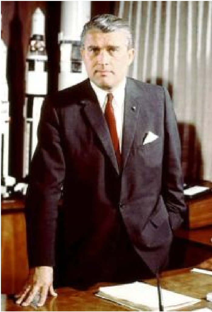
Wernher von Braun

Von Braun's early work in America involved the further development of missiles based on the German V-2 rocket which the Nazis had used to terrorize Britain during the war. This work was conducted at the U.S. Army's Fort Bliss in Texas, at the White Sands Proving Ground in New Mexico, and at the Redstone Arsenal in Alabama. Von Braun and many of his fellow Operation Paperclip Nazi scientists later worked for NASA.