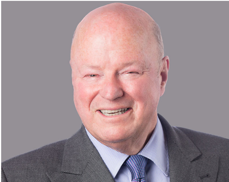
Frank Wisner Jr.

The CIA is on record as having sponsored domestic aerial spraying of biological agents.