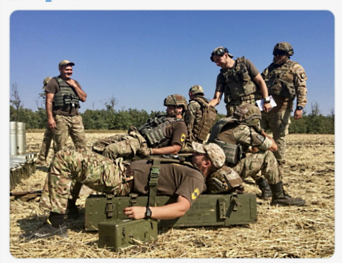
9:22 PM · Apr 22, 2019 · Twitter Web Client

OK, that's enough "inoculation" for now. We don't want to expose ourselves to too much of that stuff, or we're liable to end up supporting the wrong Nazis.