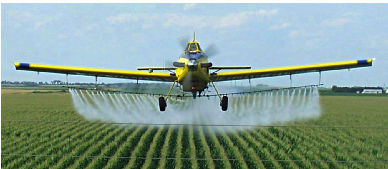
TRAUDT AERIAL SERVICE

Pesticides kill microbial life, upset natural balances, and alter human minds.