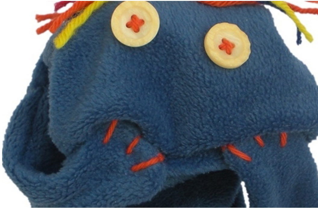
The "leader" of the "free" world?

As the 2016 presidential "campaign" season gets rolling, what makes you think that the American people actually want another (1) Clinton, or (2) Bush to choose from? Who doesn't know that both are fruit from the same poisonous tree? The Influencers either (1) don't know, (2) don't care, or perhaps (3) are losing their influence.