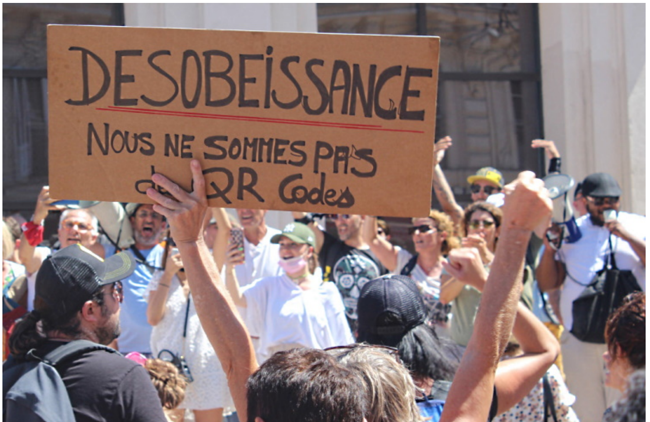
Disobdience! We are not QR codes.