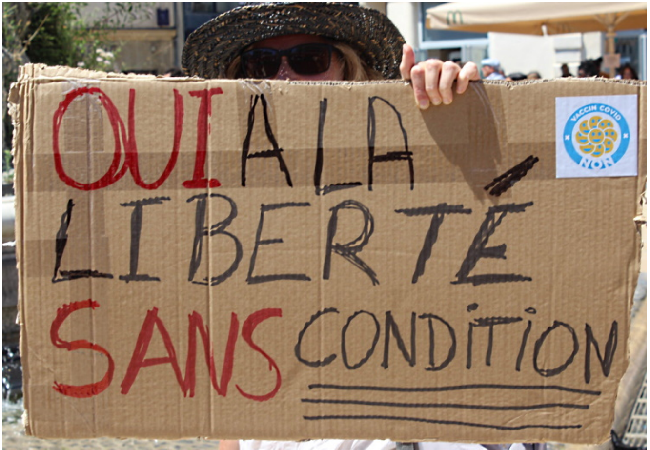
Yes to unconditional freedom