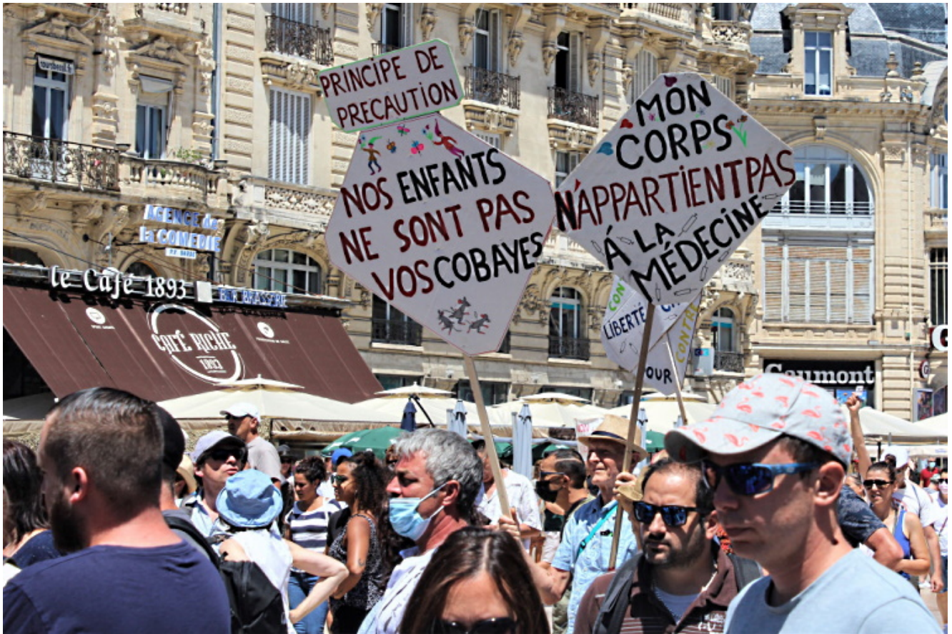
"Our children are not guinea pigs" "My body does not belong to medicine"