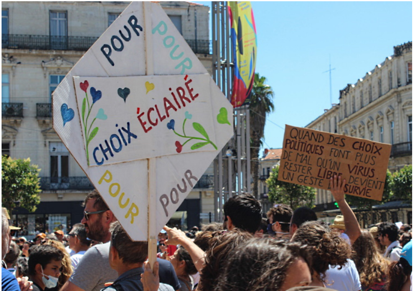
For enlightened choice