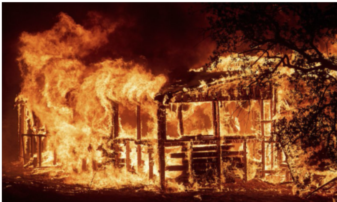
A fully engulfed structure along HWY 299 near Redding California.

The Carr Fire in Redding, California, my hometown, is one of the latest catastrophic infernos to erupt.