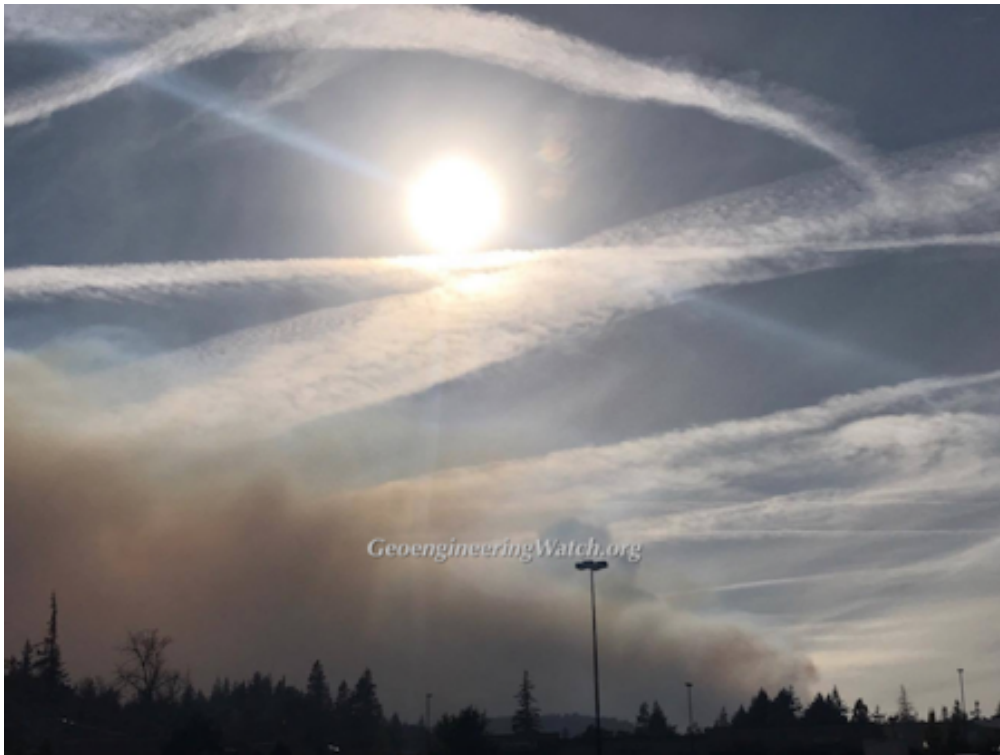
Forest fire, US West Coast.

The climate engineering atrocities are a primary factor in the equation of exponentially increasing forest fires and fire intensity.