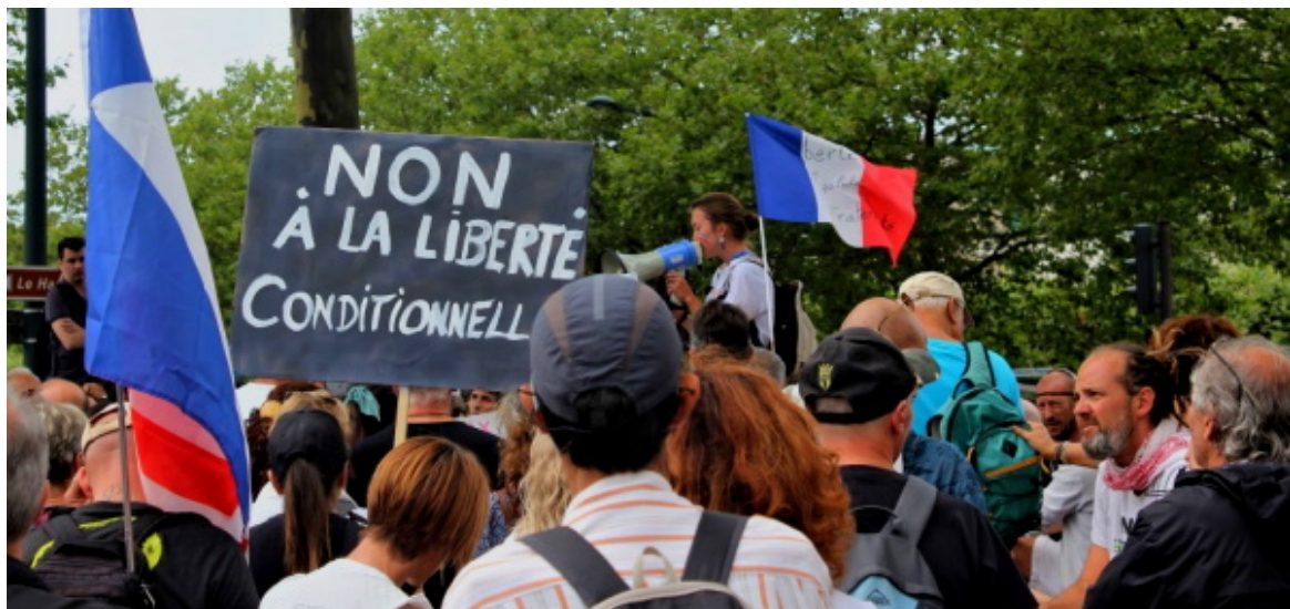
"No to conditional freedom"