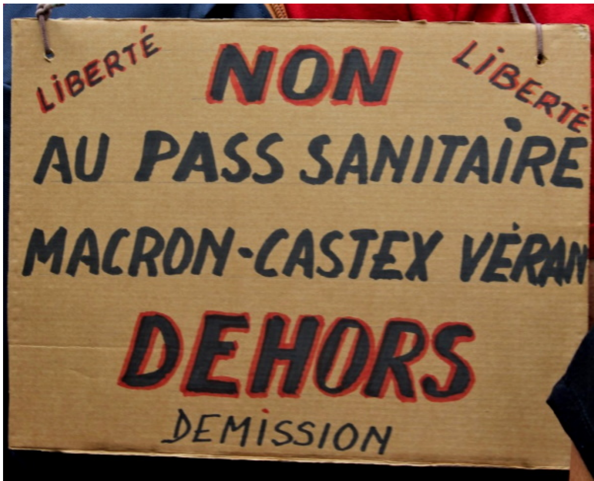
Freedom! No to the vaccine passport. Macron, Castex and