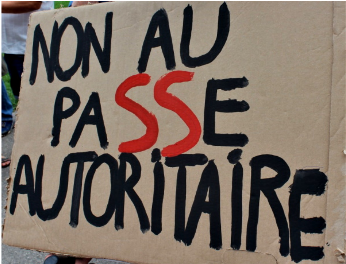
"No to the authoritarian paSSport"