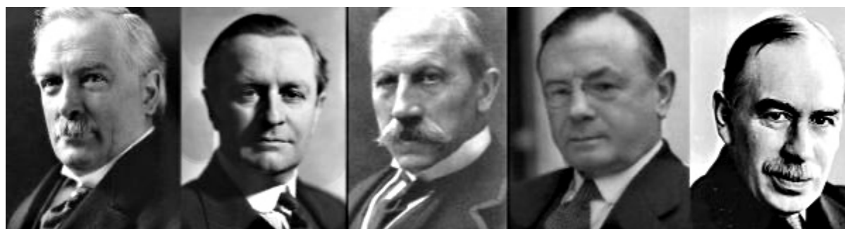
The Round Table Delegation Planning Versailles: From left to right: Lloyd George, Lord Lothian, Lord Milner, Leo Amery and Fabian leader John Maynard Keynes

Just as the British oligarchy managed the war, so too did they organize the reparations conference in France which, among other things, imposed impossible debt repayments upon a defeated Germany and created the League of Nations which was meant to become the instrument for a "post-nation state world order". Lloyd George led the British delegation alongside his assistant Philip Kerr (Lord Lothian), Leo Amery, Lord Robert Cecil and Lord John Maynard Keynes who have a long term agenda to bring about a global dictatorship. All of these figures were members of the newly emerging Round Table Movement, that had taken full control of Britain by ousting Asquith in 1916 , and which is at the heart of today's "deep state".