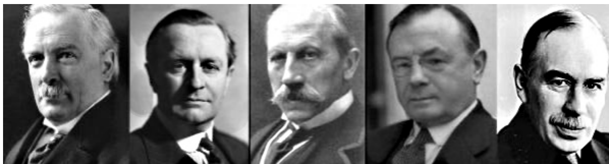
The Round Table Delegation Planning Versailles: From left to right: Lloyd George, Lord Lothian, Lord Milner, Leo Amery and Fabian leader John Maynard Keynes

Just as the British oligarchy managed the war, so too did they organize the reparations conference in France which, among other things, imposed impossible debt repayments upon a defeated Germany and created the League of Nations which was meant to become the instrument for a "post-nation state world order". Lloyd George led the British delegation alongside his assistant Philip Kerr (Lord Lothian), Leo Amery, Lord Robert Cecil and Lord John Maynard Keynes who have a long term agenda to bring about a global dictatorship. All of these figures were members of the newly emerging Round Table Movement, that had taken full control of Britain by ousting Asquith in 1916 , and which is at the heart of today's "deep state".