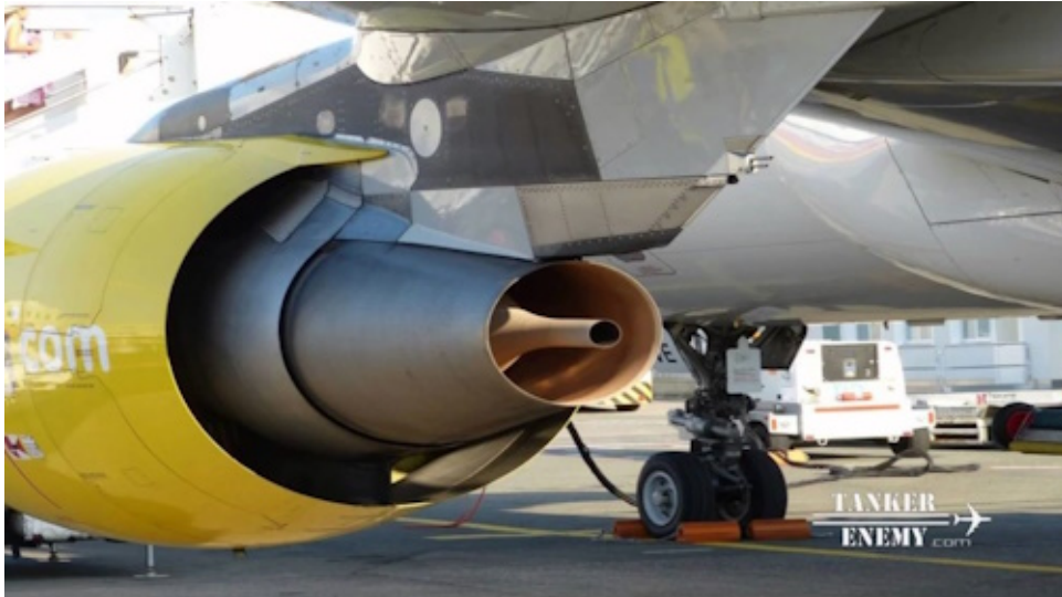
Retrofitted spray nozzle

Source of spray chemicals: http://stopsprayingcalifornia.com/