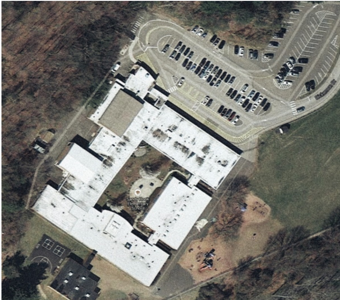
The Sandy Hook school.

And being labelled a “ conspiracy theorist ” is empty and just an attempt to discredit, silence critical thinking, and perpetuate established views. Ignore such labels.