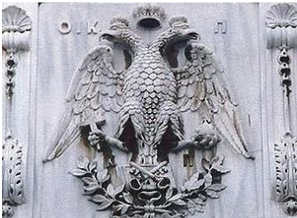
Byzantine two-headed (faced) Eagle holding the keys

It was only in the second century before the Christian era that the worship of Cybele under that name was introduced to Rome; but the same goddess, under the name of Cardea, with the "power of the key," was worshipped in Rome, along with Janus, ages before. Source