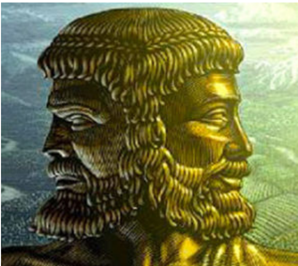
Janus Bifrons ~ Who was the two-faced Greco-Roman god?

The irony is that people not only know their rulers and society overall are two-faced, they expect it.