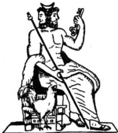
Janus with key and cock

Note Janus was depicted with a key. It turns out there's a lot to this. Remember he's the god of doors.