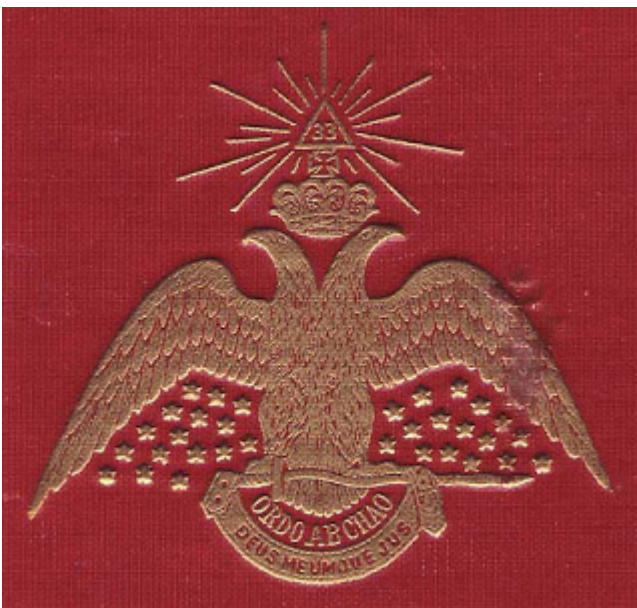
Double headed eagle on Albert Pikes Freemasonry book 'Morals and Dogma' with Order Out of Chaos slogan.