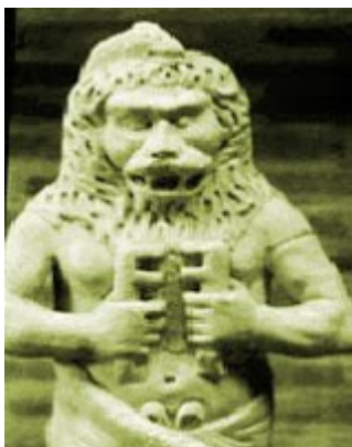
Pagan keys of Janus and Cybele

The pagan Roman priesthood (before the birth of Jesus Christ) had a sovereign pontiff who held the keys.