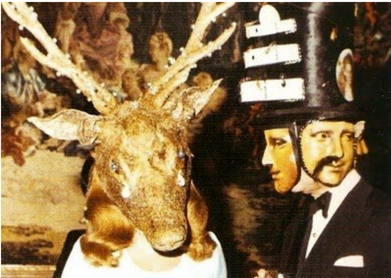
Baroness Marie-Hélène de Rothschild sporting golden calf baphomet, and Baron Alexis de Redé as two-faced Janus at a Rothschild soiree..

The elite bloodlines and their minions have been into this for millennia. Take a look at an occult Rothschild party in the early part of last century: