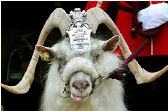
The Queen of England's royal Masonic goat on parade.