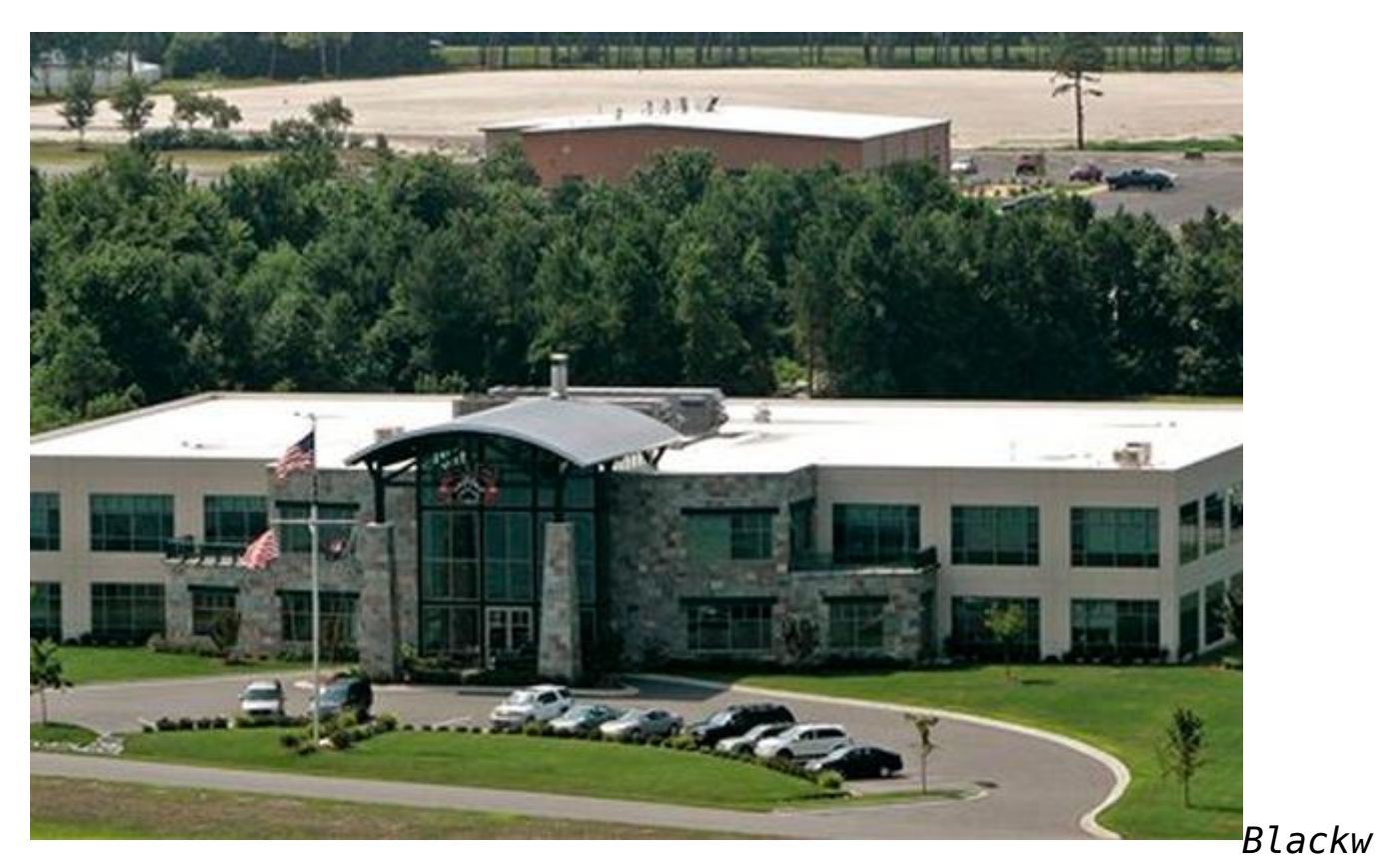
ater/Xe Headquarters in Moyock, N.C.