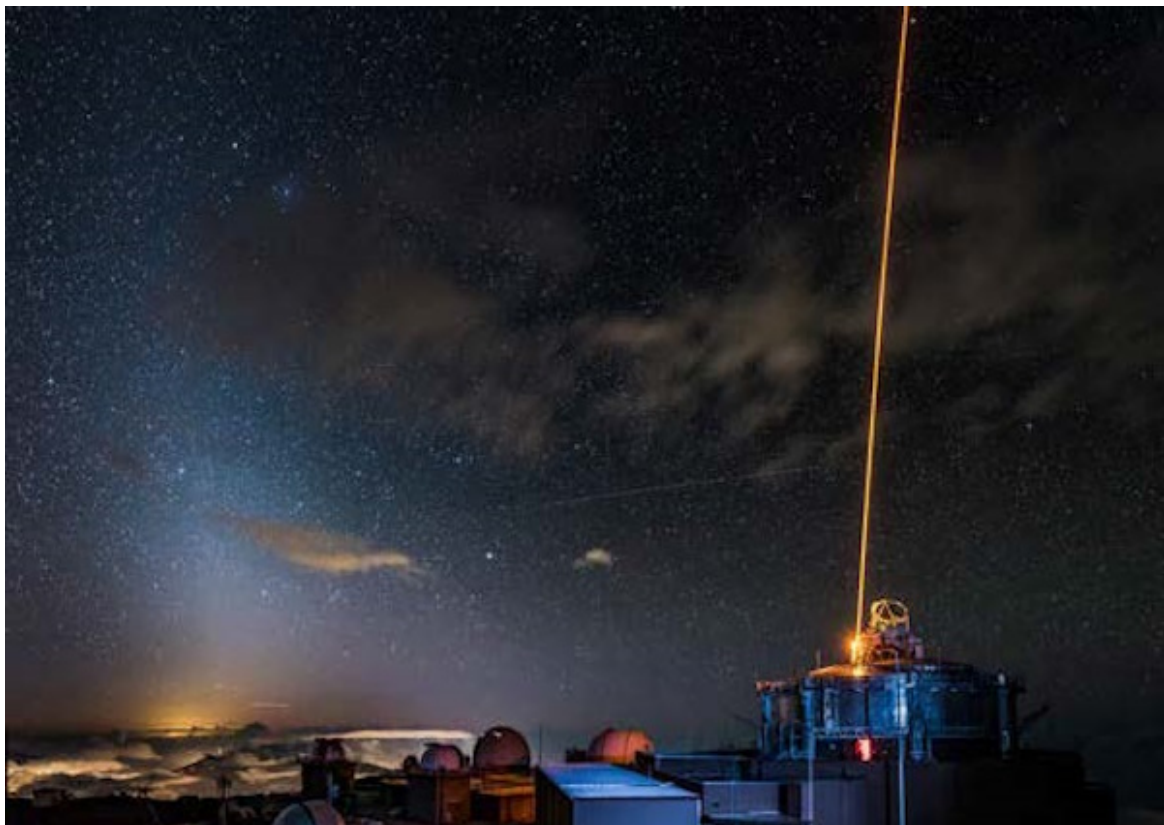
Picture of the Maui Space Surveillance facility atop Haleakala shooting a sodium guidestar posted on the AFRL website

SPSS also operates the experimental systems under the AFRL "15 SPSS is a component of Space Delta 2 and also operates experimental systems under the Air Force Research Laboratory [AFRL]." The Directed Energy Directorate is a component department of the AFRL with expertise in directed energy. That means that the 15 SPSS operates the AFRL experimental directed energy weapons. And it does so from the summit of Haleakala overlooking Maui. Haleakala is the perfect location to control directed energy weapons targeting Lahaina.