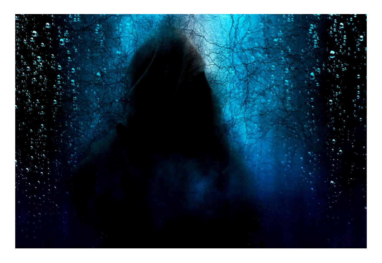
The Parasitic Loosh Harvest Reality - Child Abuse and

The engineered wars, terror, tension and scarcity memes used for millennia, and heightened today by the aid of artificially intelligent empowered synthetic technology, makes for fertile ground for abuse and negative loosh production.