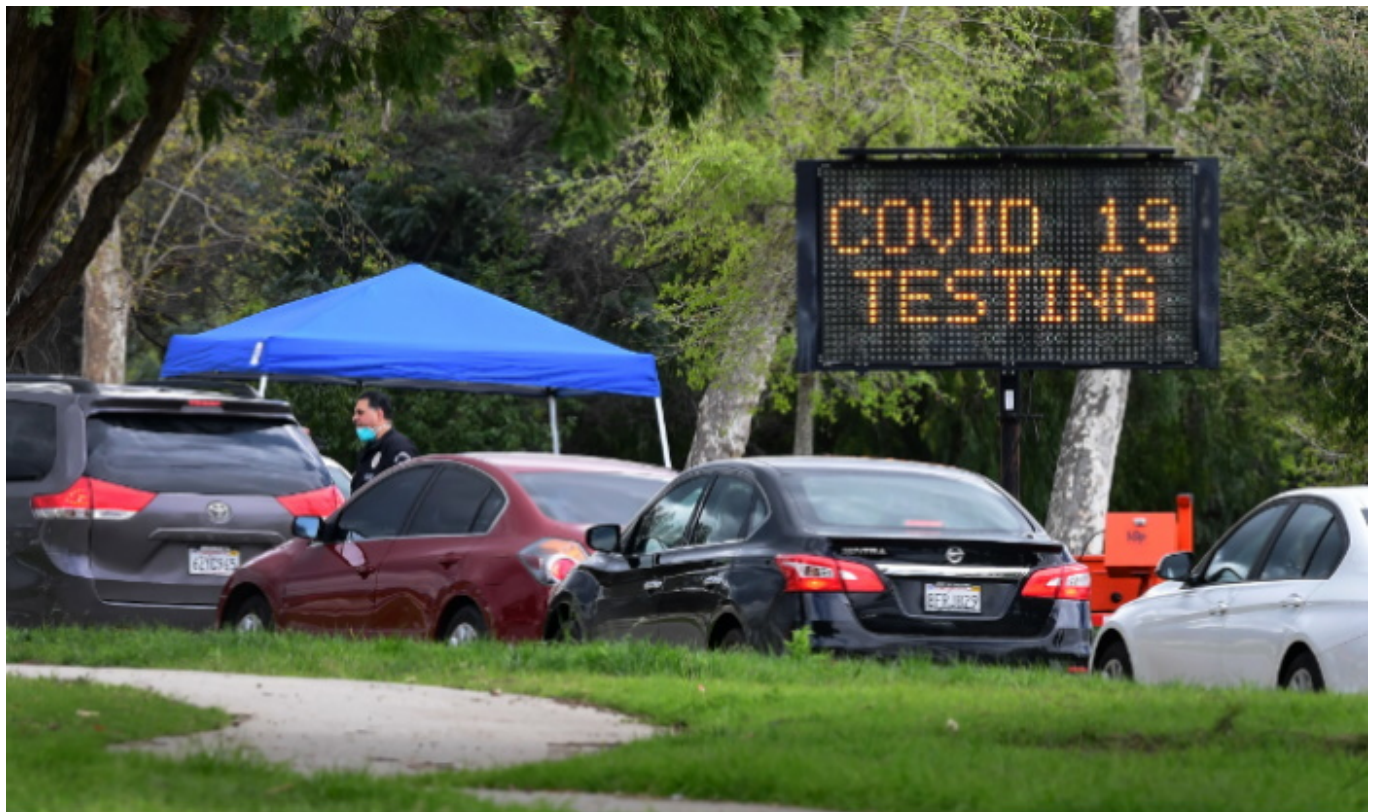
The "tailgate" party for 2020?

Just look at how peoples all across the world have been led to believe (be-LIE-ve) that COVID-19 is potentially so "dangerous" that they think it is a reasonable suggestion (or mandate) to: