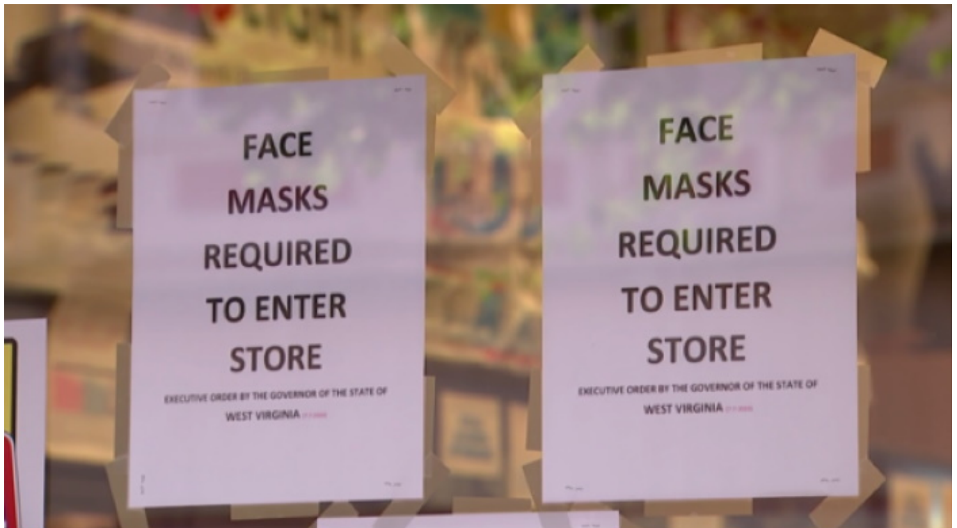
Jim Crow for 2020, Health Discrimination

But there's no denying that the only "future" that these people are "promising", is more viruses, more diseases, more plagues and catastrophes.