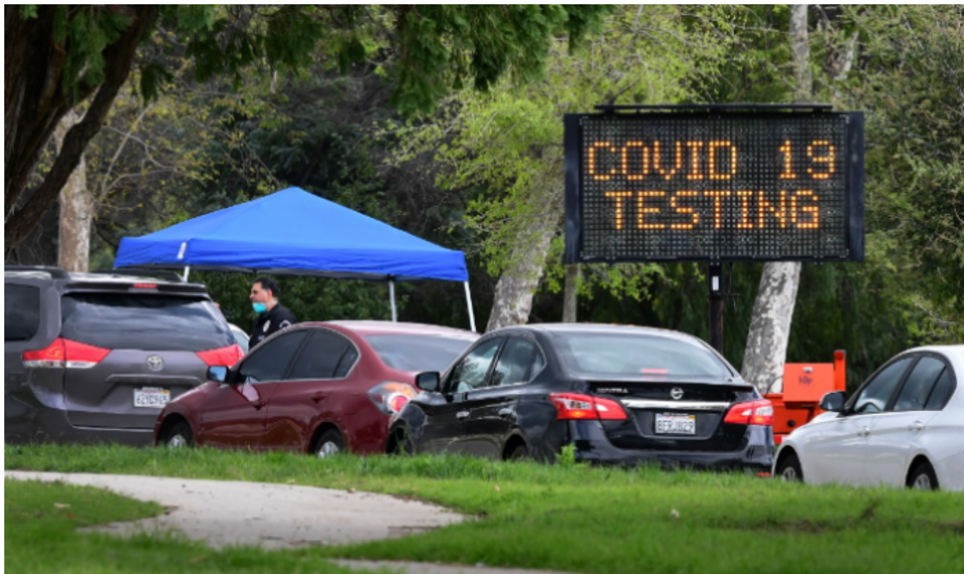
The "tailgate" party for 2020?

Just look at how peoples all across the world have been led to believe (be-LIE-ve) that COVID-19 is potentially so "dangerous" that they think it is a reasonable suggestion (or mandate) to: