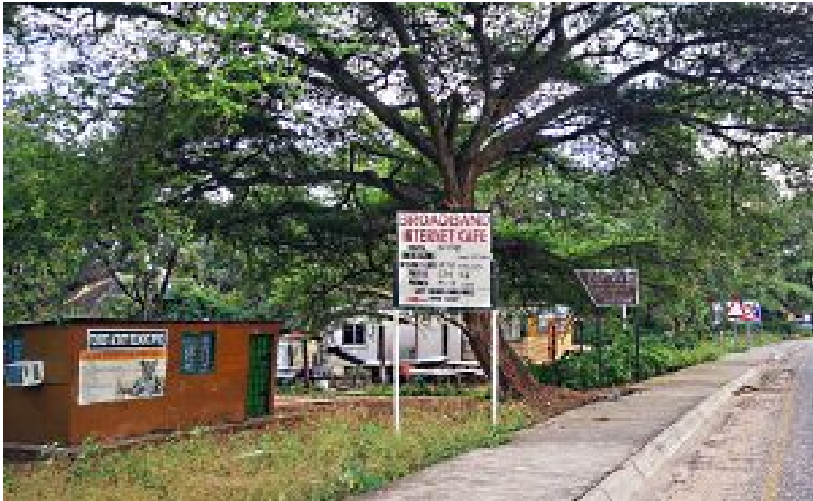
Internet cafe – Kasane, Botswana in the Chobe region

Here's a glimpse of life in the town of Kasane: