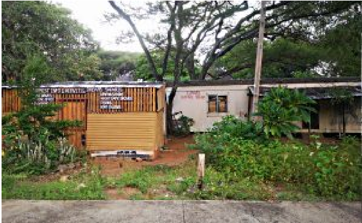
Tourist, safari center – Kasane, Botswana in the Chobe region