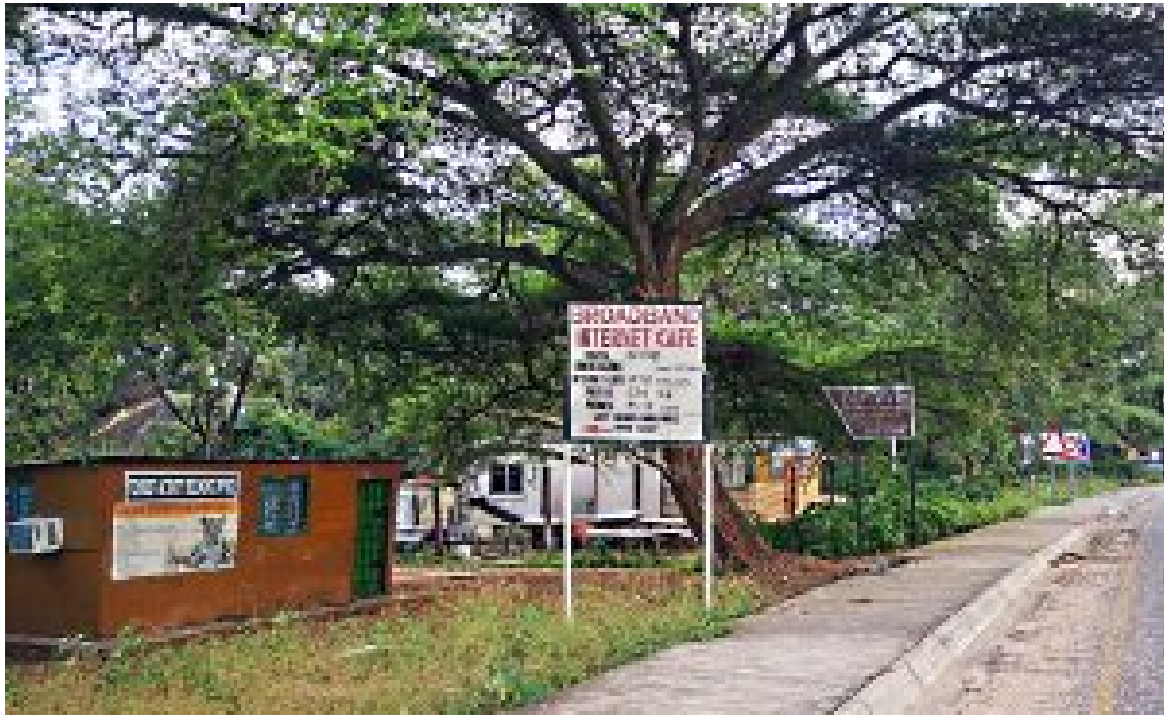
Internet cafe – Kasane, Botswana in the Chobe region

Here's a glimpse of life in the town of Kasane: