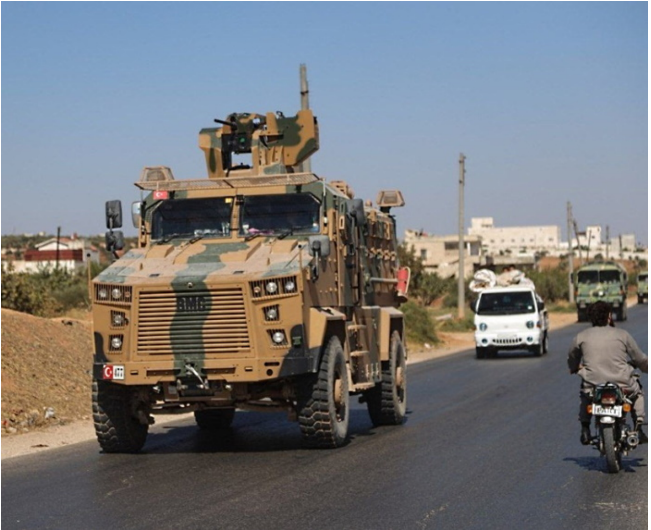
Turkish convoy entering Quqfin in October 2020.