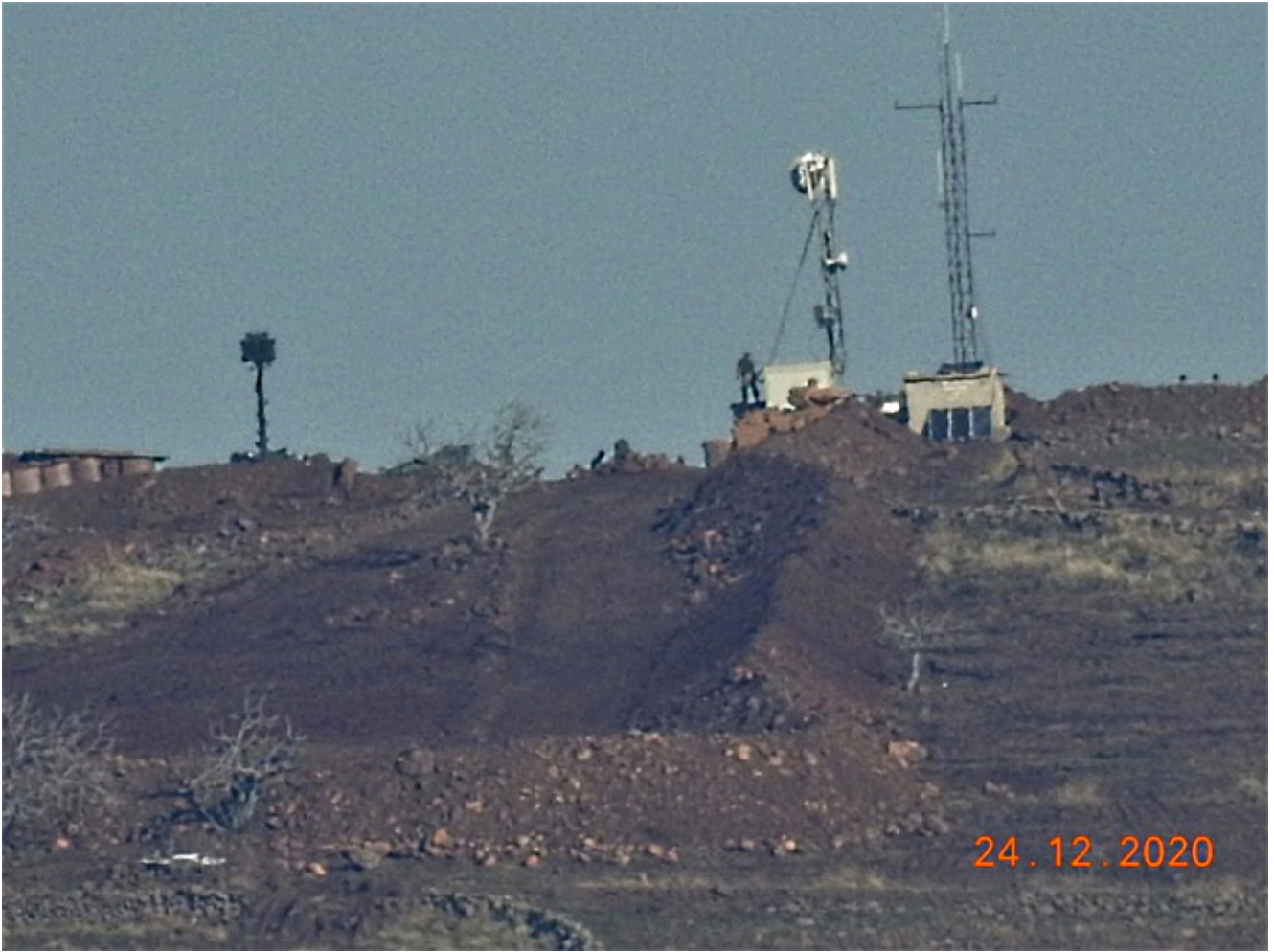
Turkish base in Quqfin.