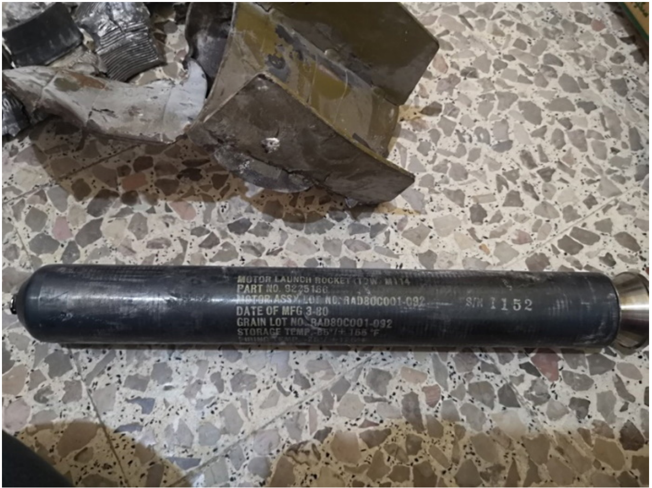
Unexploded TOW missile that was used against civilian targets in Jurin.

Unexploded #US TOW rocket in #Jurin #Idlib borders today. "Humanitarian aid" enables the supply of these weapons to #AlQaeda to kill #Syrian civilians. When the #UN sheds crocodile tears for "humanitarian" crisis, it is enabling US regime sanctioned terrorism. @dgaytandzhieva pic.twitter.com/50liw8g7oj