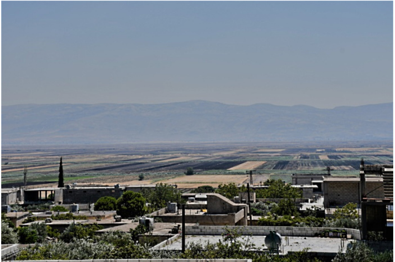
Burned and charred fields in Jurin.

which are being used to torch farmland and agricultural crops, again a familiar tactic to starve civilians and force them to leave their land. I was shown fields that were blackened and burned as evidence of this barbaric practice.