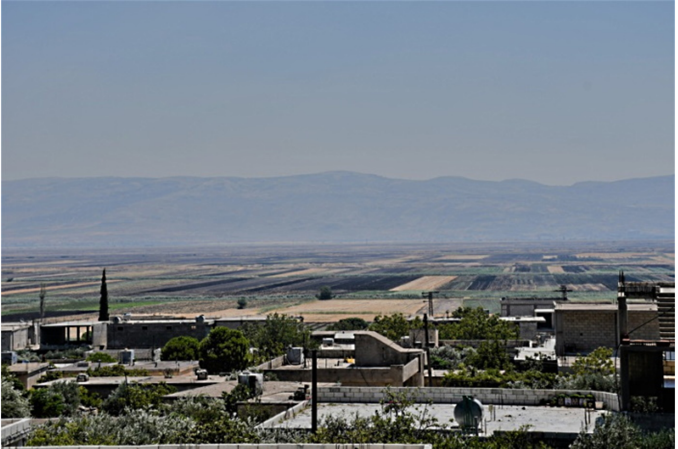
Burned and charred fields in Jurin.

which are being used to torch farmland and agricultural crops, again a familiar tactic to starve civilians and force them to leave their land. I was shown fields that were blackened and burned as evidence of this barbaric practice.