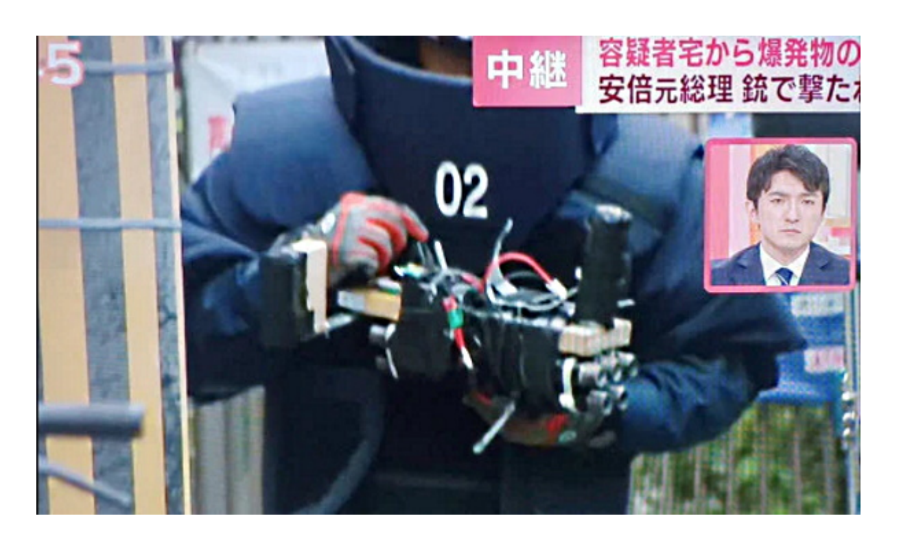
THE BACKGROUND AND CONTEXT