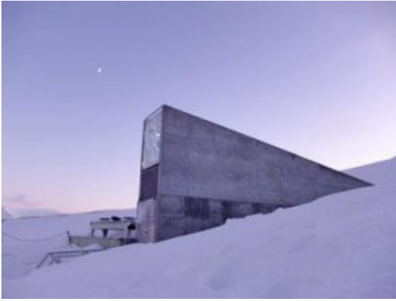
Norway Seed Vault