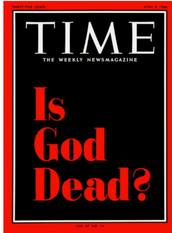
April 8, 1966 Cover Time Magazine

It's time to START asking for, seeking, discovering, and when found, being guided by TRUTH which unless functionally numbed by chemical contaminants, each has the ability to discern and CHOOSE.