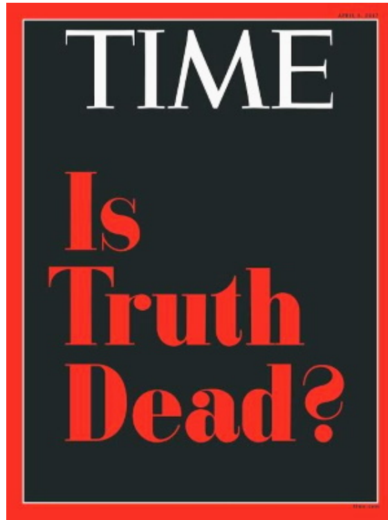
March 23, 2017 Time Magazine cover.

Unfortunately, they revisited the subject in 2017, but the focus was political, as the media remained constantly vigilant with regard to then president Donald Trump's apparent deviations from truth. That vigilance was set aside throughout the 2020 election process and installation of Joe Biden as titular president. However, the massive fraud ~ in the biological context ~ of the Pandemic itself, which has been a pretext behind many of the social atrocities that are still being propagated today, goes unnoticed.