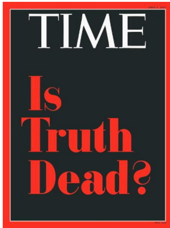
March 23, 2017 Time Magazine cover.

Unfortunately, they revisited the subject in 2017, but the focus was political, as the media remained constantly vigilant with regard to then president Donald Trump's apparent deviations from truth. That vigilance was set aside throughout the 2020 election process and installation of Joe Biden as titular president. However, the massive fraud ~ in the biological context ~ of the Pandemic itself, which has been a pretext behind many of the social atrocities that are still being propagated today, goes unnoticed.