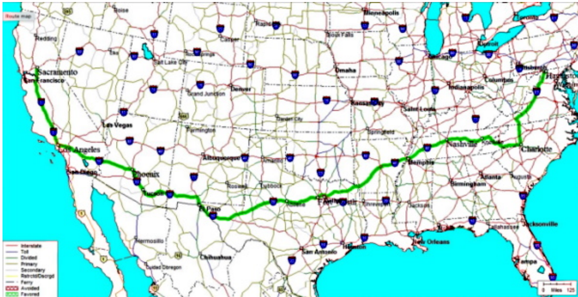
Map/Hagerstown to Sacramento/The People's Convoy