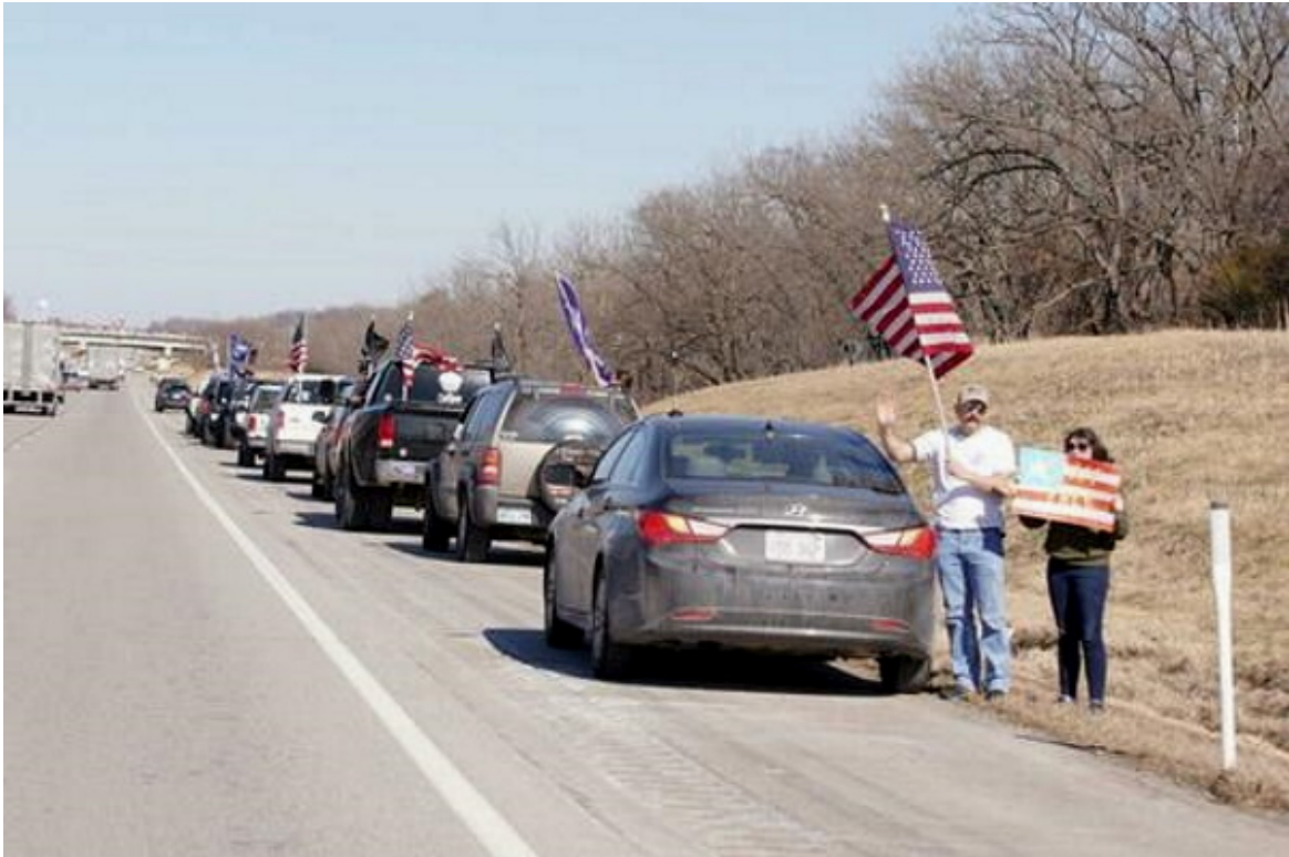
Convoy supporters in Oklahoma on Feb. 27, 2022.

Organizers have been sending drones up periodically to capture estimates of vehicles traveling with the group, which has drawn thousands of people to roadsides as the convoy passes by.