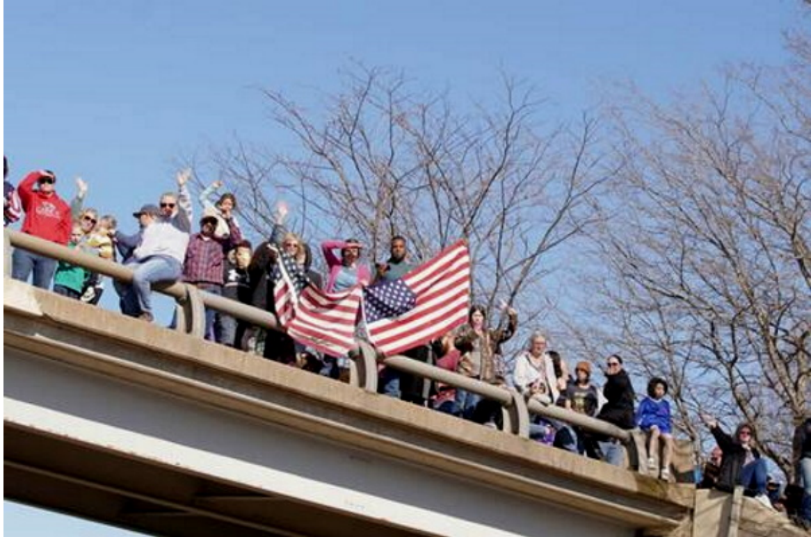
Convoy supporters in Oklahoma on Feb. 27, 2022.

the road in Oklahoma on Feb. 27, 2022.