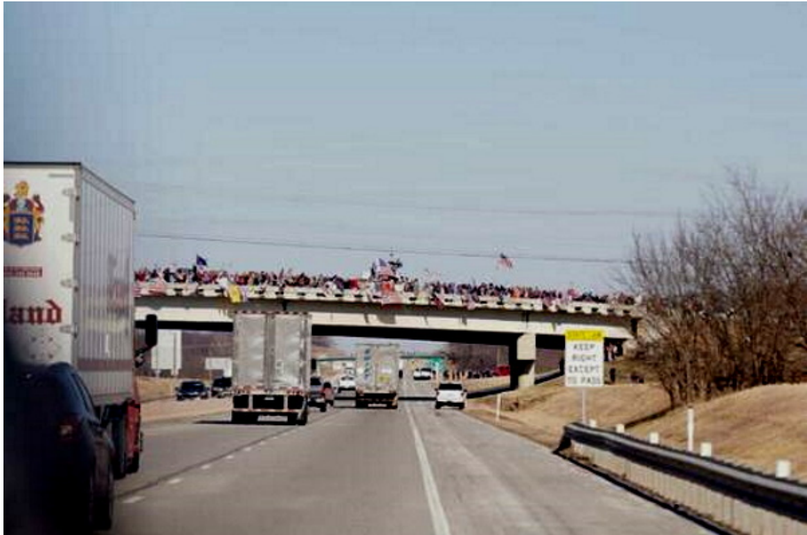
Truckers part of The People's Convoy drive past an overpass with supporters in Oklahoma on Feb. 27, 2022.