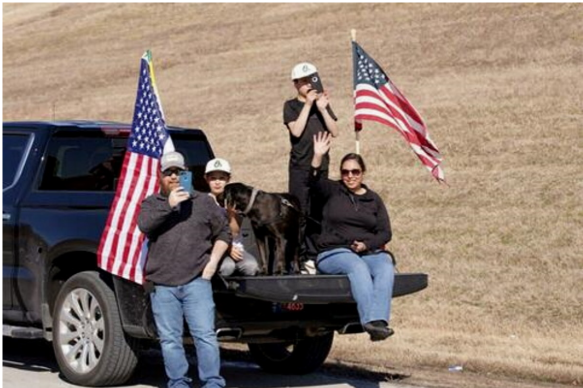
Convoy supporters wave American flags by the side of