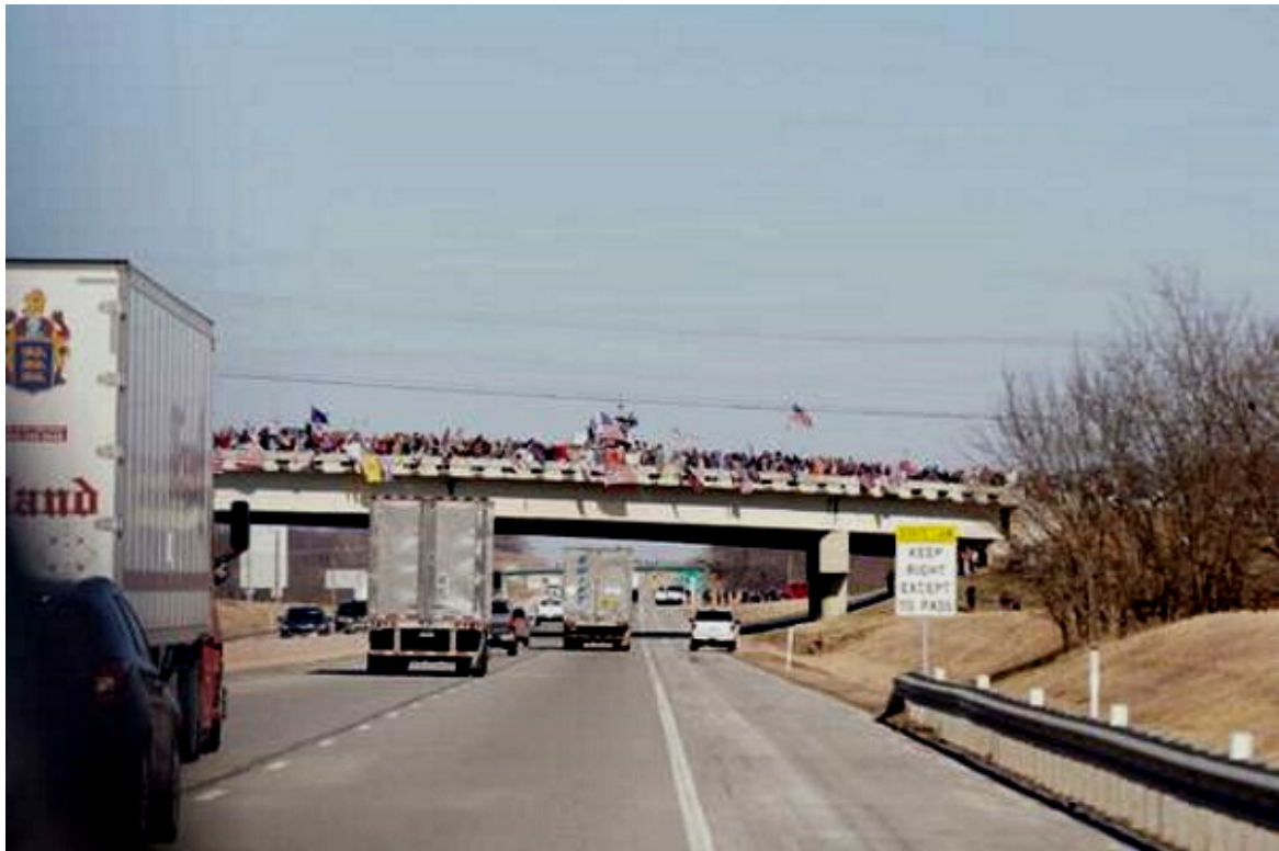
Truckers part of The People's Convoy drive past an overpass with supporters in Oklahoma on Feb. 27, 2022.