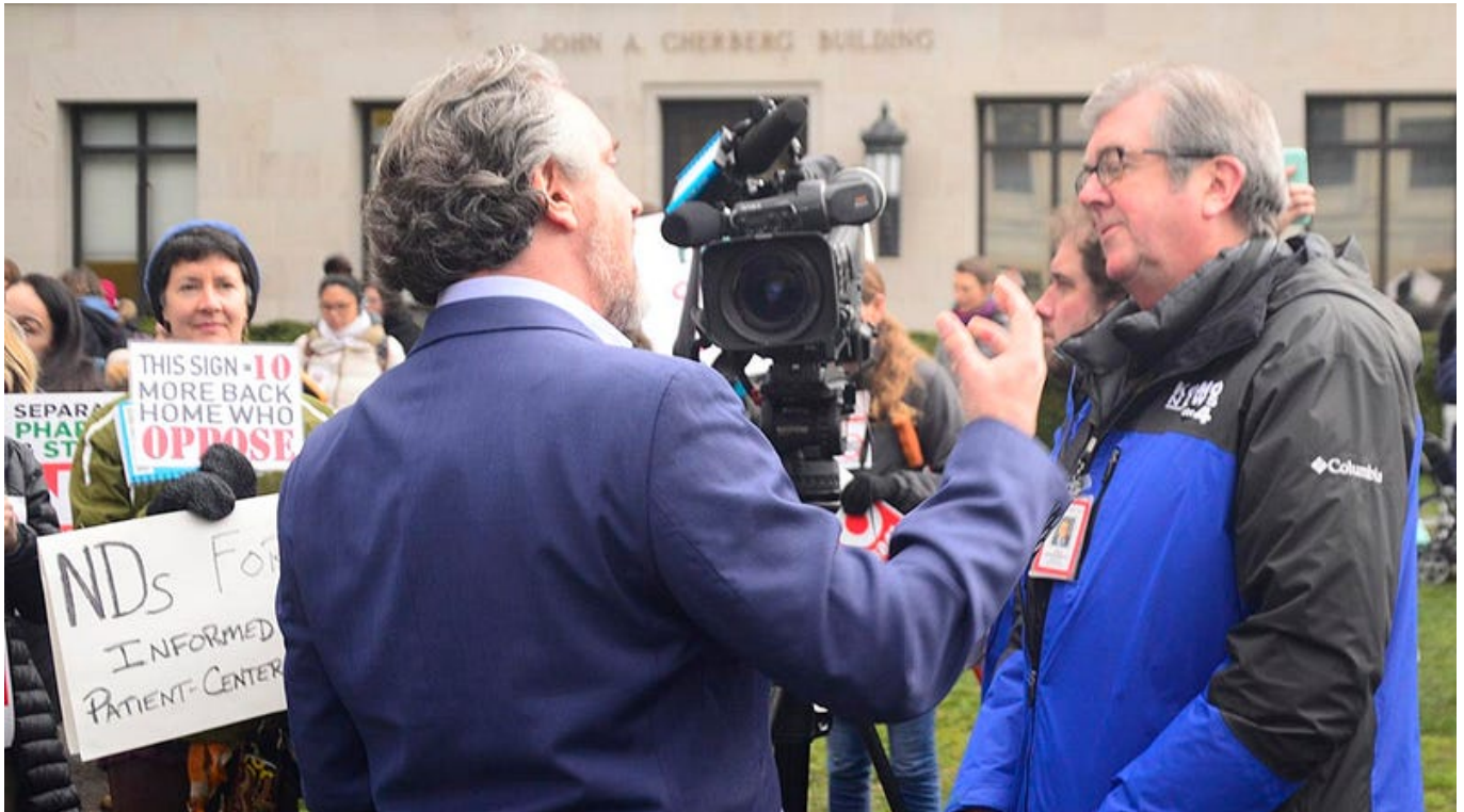
Del Bigtree, producer of the film "Vaxxed" covers talking points with local TV reporter.

Interesting term, "vaccine hesitancy". I'd use the words legitimate reason, common sense, overwhelming evidence that something is not as it should be.