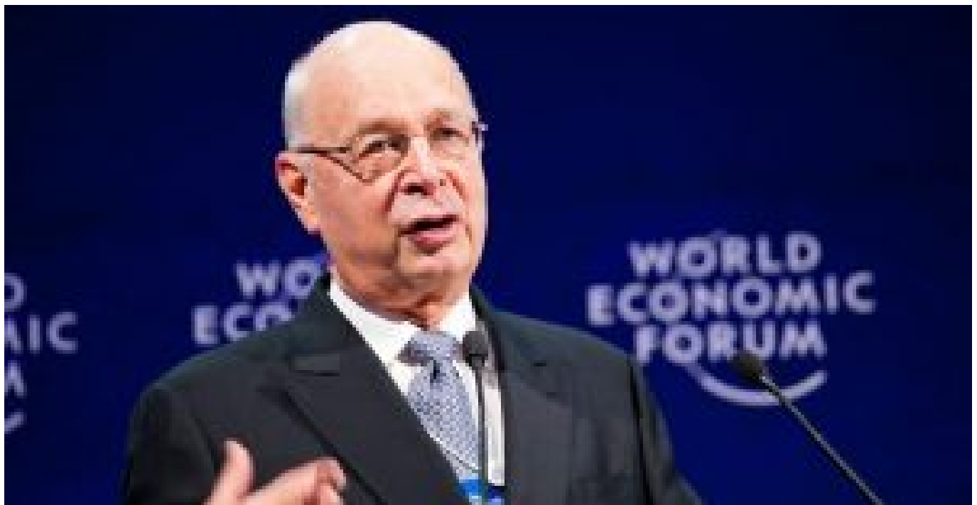
Klaus Schwab, founder and executive chairman of the World Economic Forum.